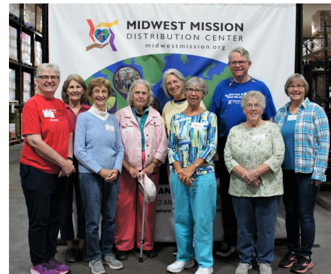
Monticello UMC Monticello, IL