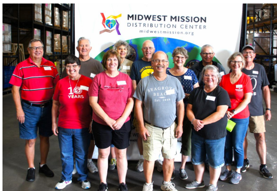
Emmanuel UMC Noblesville, IN