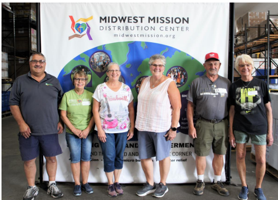
Zion UMC, Batavia Adell, WI