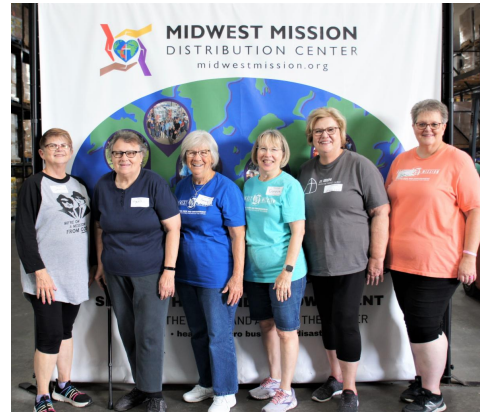
St. Joseph UMC St. Joseph, IL