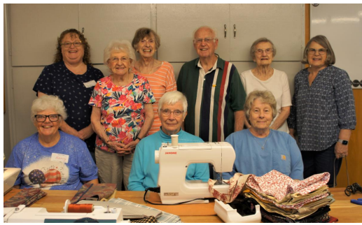
Sewing Group from First UMC Springfield Springfield, IL