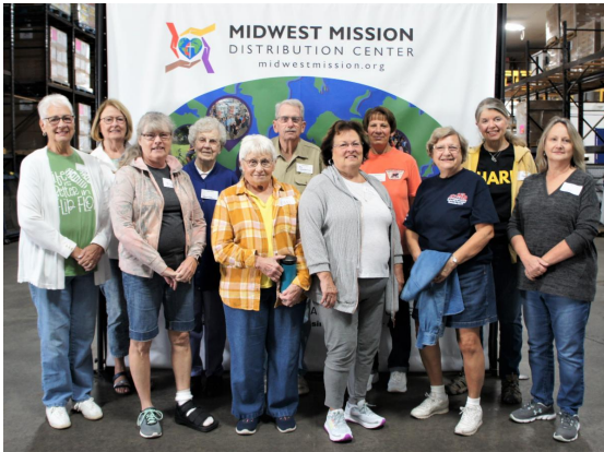
Taylorville UMC Taylorville, IL