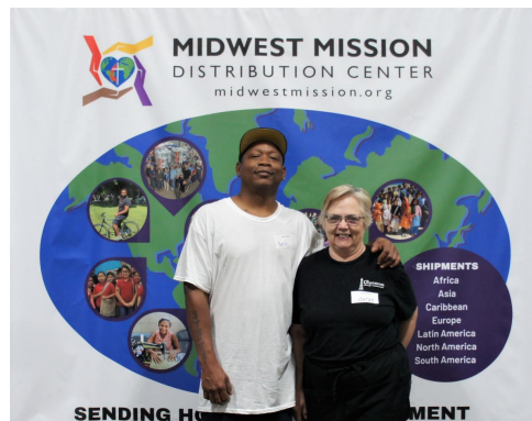
Lighthouse Rochester, IL