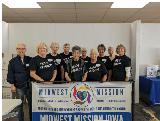
Hope Church Pocahontas, IA

We are so grateful for all our local and regular volunteers, and the time they give towards volunteering at Midwest Mission. We appreciate their passion and dedication to the ministry!