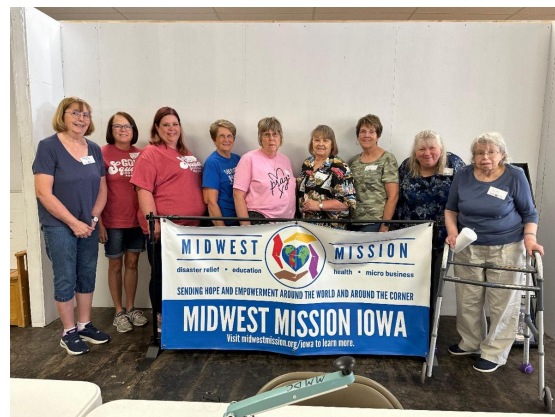
Carroll FUMC Carroll, IA