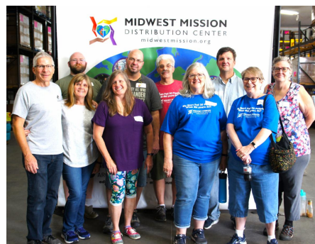
First UMC St. Joseph, MI