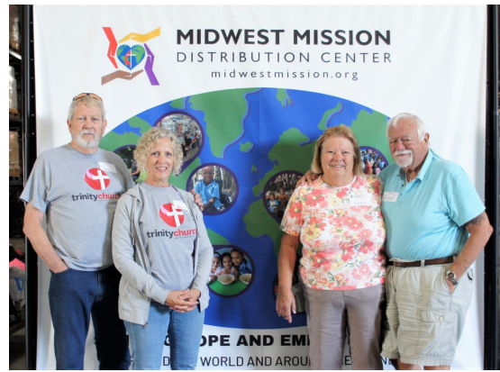
Trinity New Albany, IN