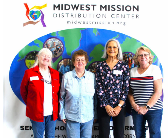
Quilting Friends Jacksonville, IL

We are so grateful for all our local and regular volunteers, and the time they give towards volunteering at Midwest Mission. We appreciate their passion and dedication to the ministry!