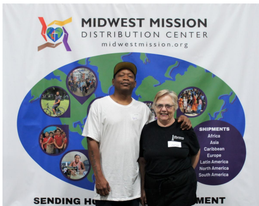
Lighthouse Rochester, IL