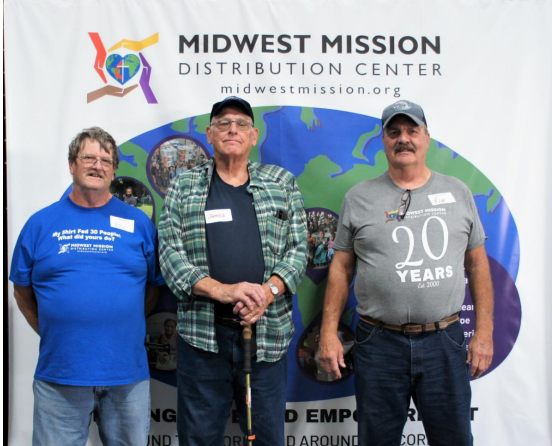
Gibson City UMC Gibson City, IL