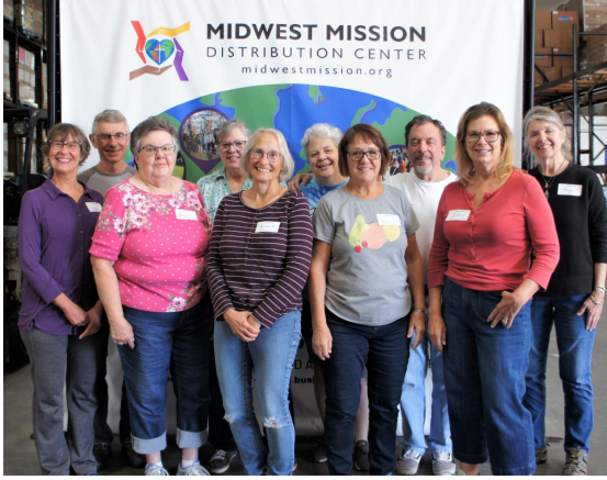
Simpson Group Springfield, IL