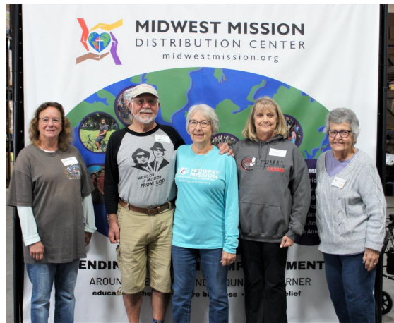
Grace UMC Jacksonville, IL