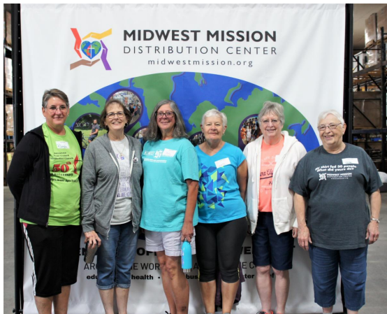
Mount Carroll UMC Mount Carroll, IL