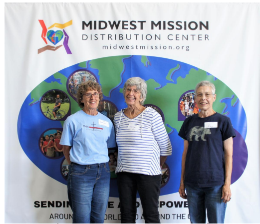
First UMC Lansing, IL