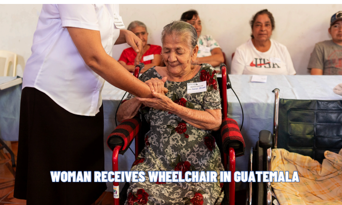
WOMAN RECEIVES WHEELCHAIR IN GUATEMALA