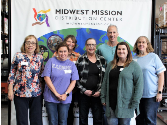
UTG Springfield, IL