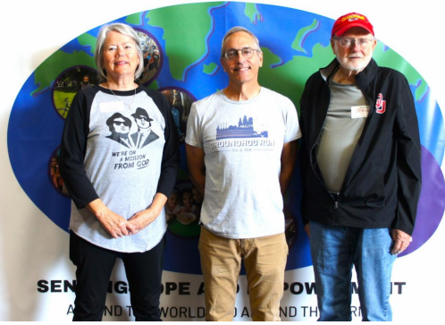
Asbury UMC Prairie Village, KS