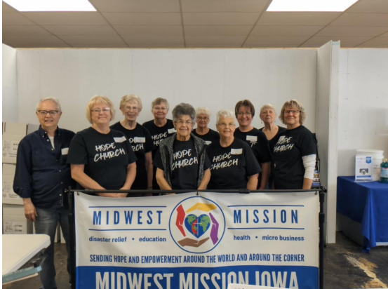
Hope Church Iowa