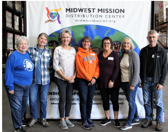
Simpson Group Springfield, IL