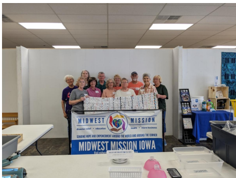
Cedar Falls UMC Iowa