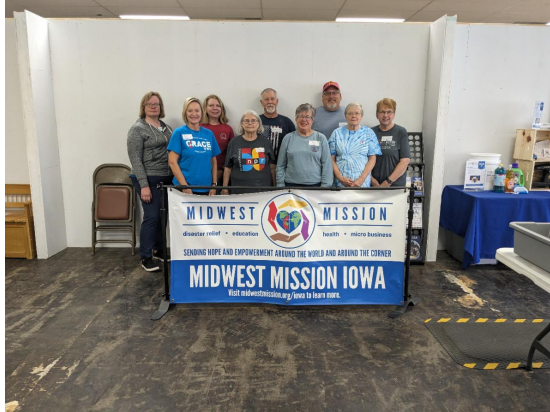
Sioux City Grace UMC Iowa