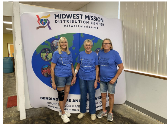
Prairie Chapel Church Marion, IA

We are so grateful for all our local and regular volunteers, and the time they give towards volunteering at Midwest Mission. We appreciate their passion and dedication to the ministry!