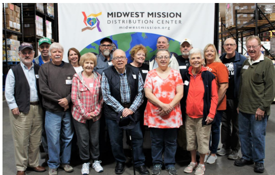
St. Lukes UMC - River Bluff Center Maryville, IL

We are so grateful for all our local and regular volunteers, and the time they give towards volunteering at Midwest Mission. We appreciate their passion and dedication to the ministry!