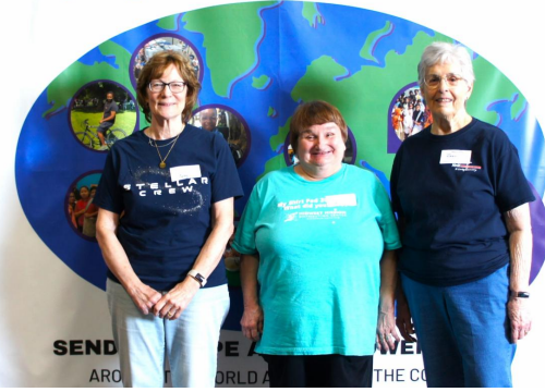
Athens UMC Athens, IL