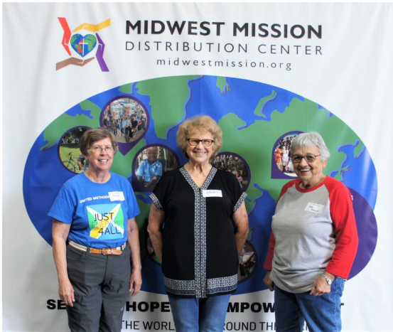
Centenary UMC Jacksonville, IL