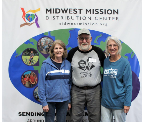
Monticello UMC Monticello, IL