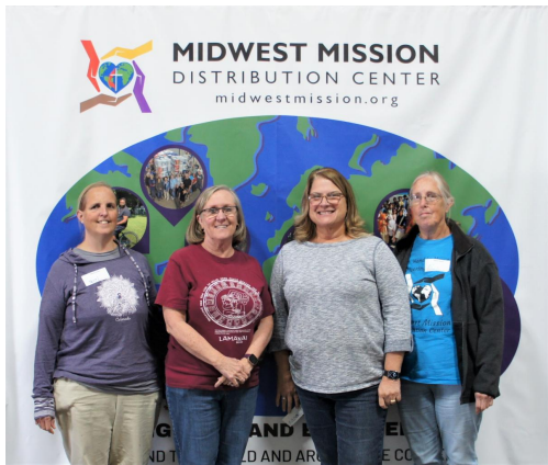
First UMC Mt Vernon, IN