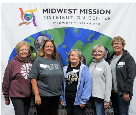
Johnson UMC New Harmony, IN