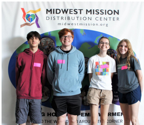
National Honor Society Students Springfield, IL