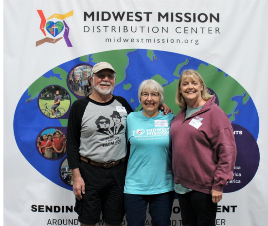
Grace UMC Jacksonville, IL