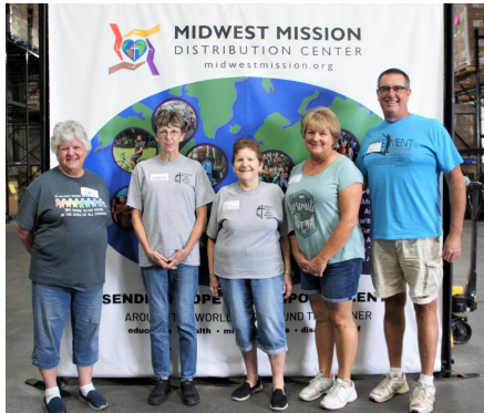
Ellettsville UMC Ellettsville, IN