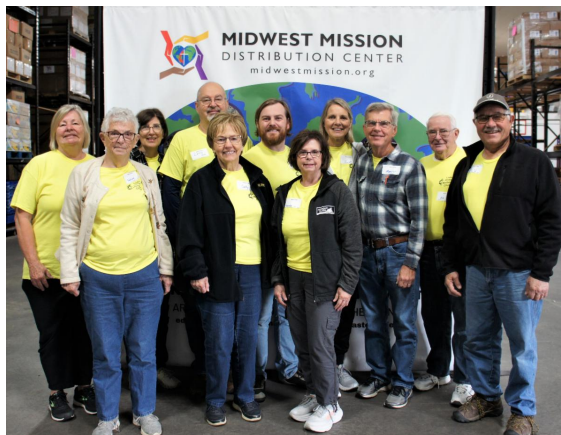
Loda UMC Loda, IL

We are so grateful for all our local and regular volunteers, and the time they give towards volunteering at Midwest Mission. We appreciate their passion and dedication to the ministry!