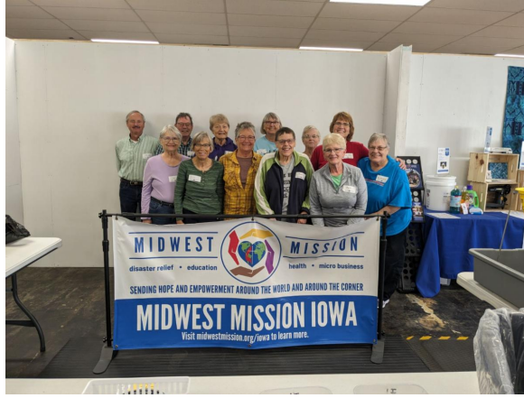
St. Luke UMC Newton, IA

We are so grateful for all our local and regular volunteers, and the time they give towards volunteering at Midwest Mission. We appreciate their passion and dedication to the ministry!