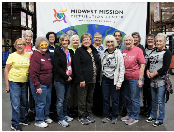
Great Plains Conference UWF Nebraska and Kansas