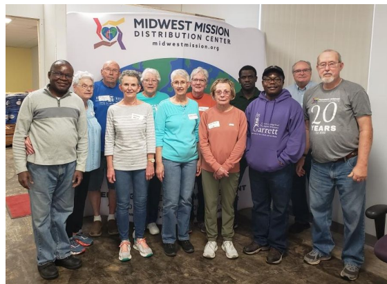
Camp Clear Lake District Iowa