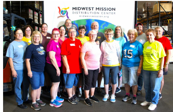
Westwood UMC Kalamazoo, MI