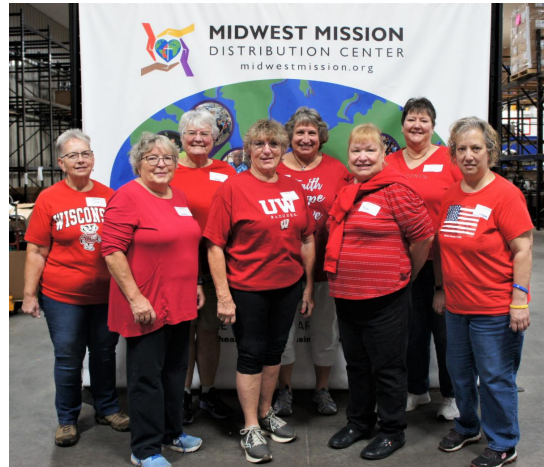
Church of the Pines UMW Minocqua, WI