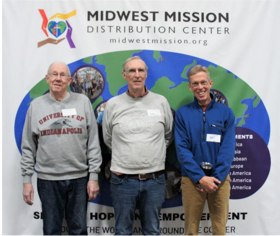
Douglas Avenue UMC Springfield, IL