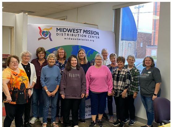
Centenary UMC Jacksonville, IL