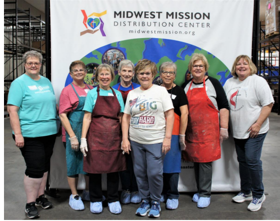
Union Reunion St. Louis, MO