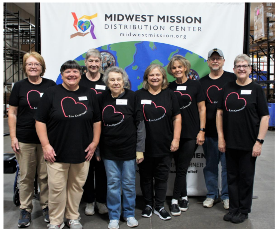
Oak Creek Community UMC Oak Creek, WI