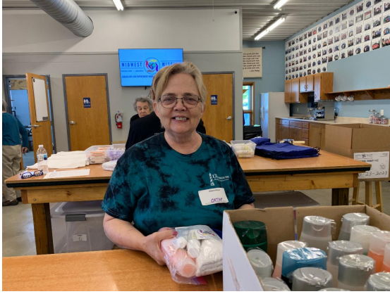
Lighthouse Rochester, IL