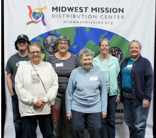
Meridian Street UMC Indianapolis, IN