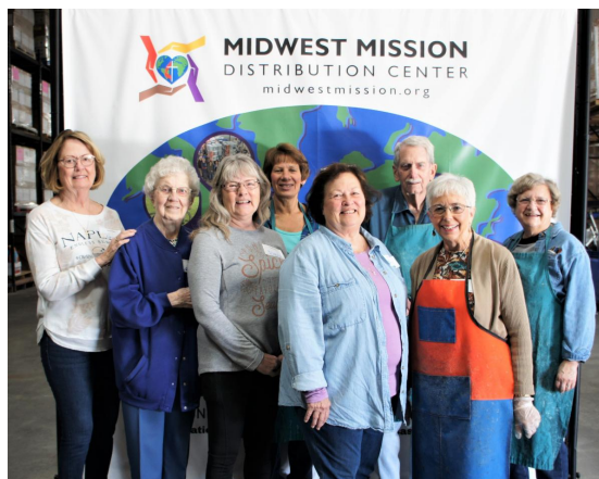
Taylorville UMC Taylorville, IL