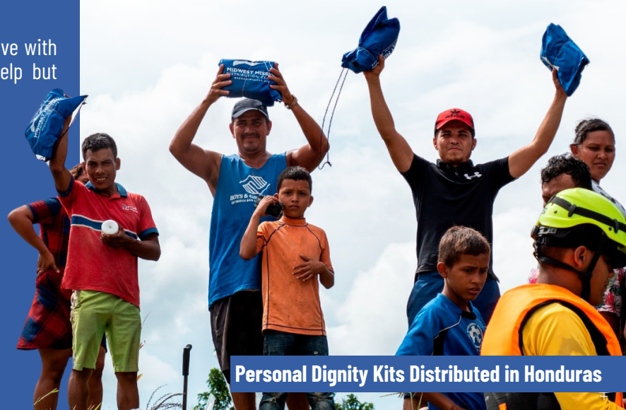
Personal Dignity Kits Distributed in Honduras

Around the world and around the corner, people are in need of basic resources that would give them a hand up in life. As Christians, our mission is to show God's love. At Midwest Mission, we show God's love in a practical way, sharing His love and helping those in need in the right way.