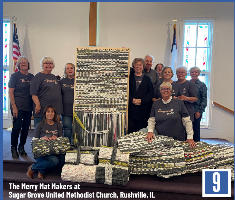
The Merry Mat Makers at Sugar Grove United Methodist Church, Rushville, IL

The Sleeping Mats are given to people who are sleeping in less than desirable conditions. It gives a dry, dirt-free space to get a good night's sleep. The mats are freely given both internationally and in the United States. To learn more, or to get a loom, go to midwestmission.org/loom or contact teresa@midwestmission.org .