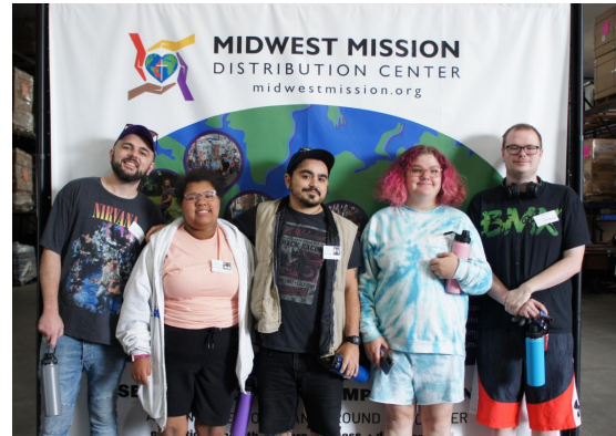
SPARC Springfield, IL

Not Pictured: Springfield First UMC Sewing Group, Springfield, IL