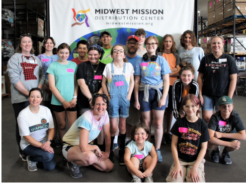
Centennial UMC Youth Roseville, MN