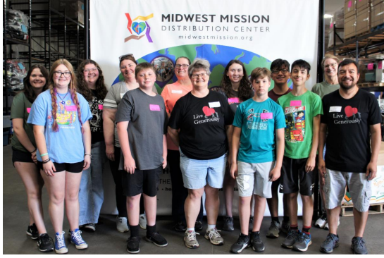
Trinity Lutheran Youth Auburn, IL