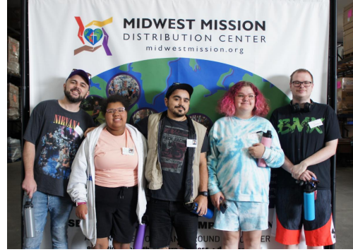
SPARC Springfield, IL