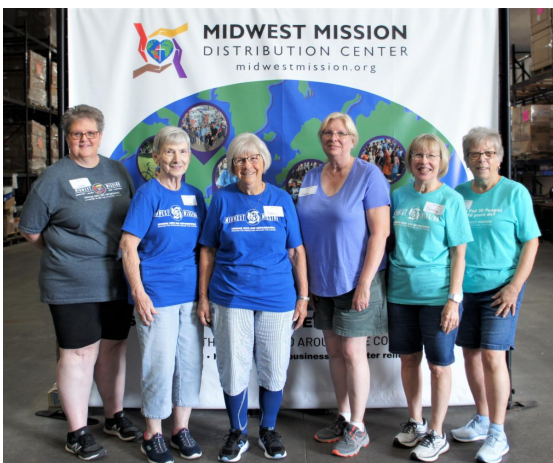
St. Joseph UMC St. Joseph, IL