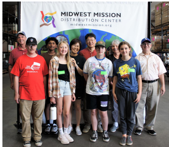
Christ UMC Algonquin, IL

We are so grateful for all our regular volunteers, and the time they give towards volunteering at Midwest Mission. We appreciate their passion and dedication to the ministry!