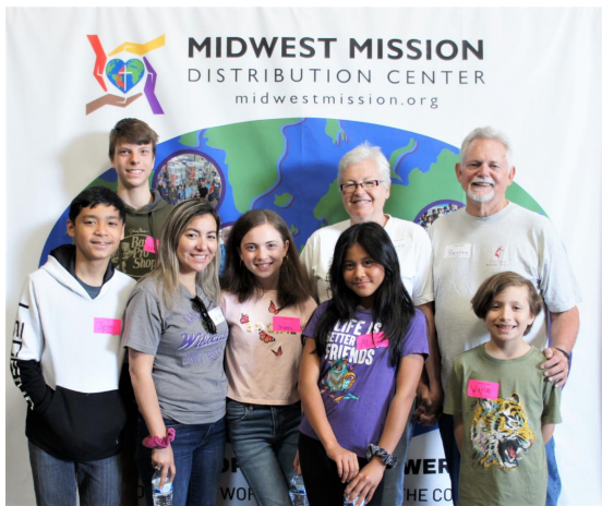
Ogden Friendship House UMC Manhattan, KS