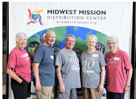
Union Reunion St. Louis, MO