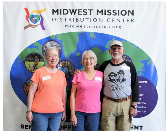
Grace UMC Jacksonville, IL