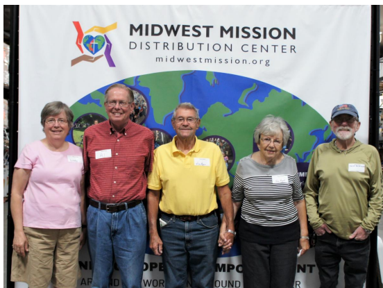
Simonson Group Delavan, IL