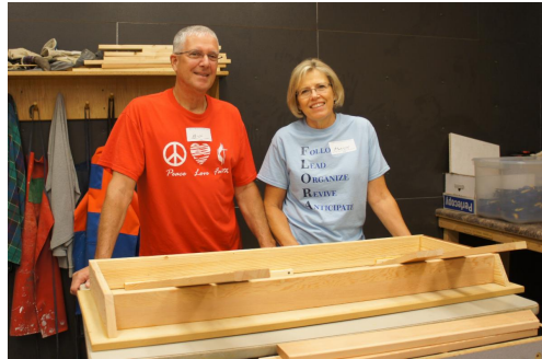
Flora UMC Flora, IL

Not pictured: Springfield First UMC Sewing Group, Springfield, IL