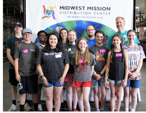
Troy Youth Troy, IL

We are so grateful for all our regular volunteers, and the time they give towards volunteering at Midwest Mission. We appreciate their passion and dedication to the ministry!