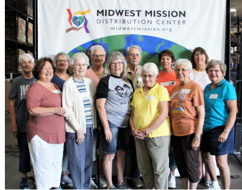
Taylorville UMC Taylorville, IL