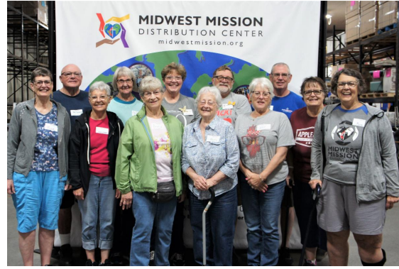
First UMC Nebraska City, NE