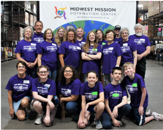
First UMC Dixon, IL