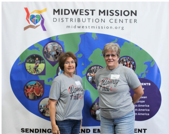
Waverly First UMC Waverly, IL