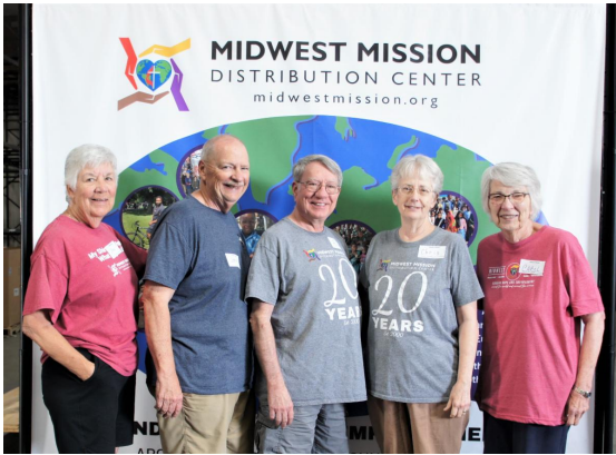
Union Reunion St. Louis, MO