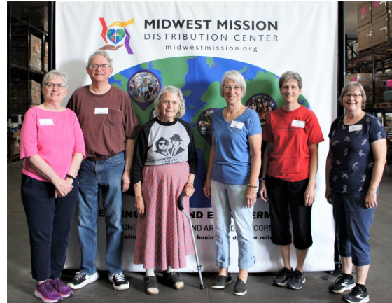
Monticello UMC Monticello, IL