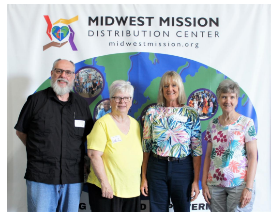
Bellflower UMW Bellflower, IL