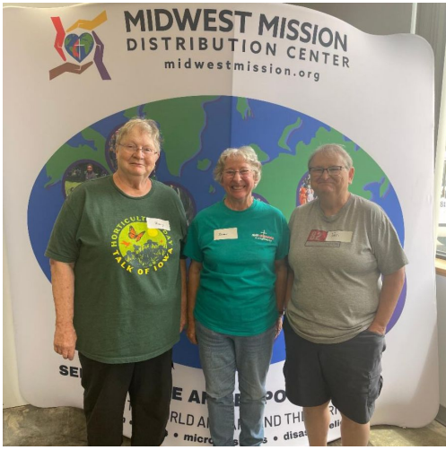
Staves Memorial UMC Des Moines, IA