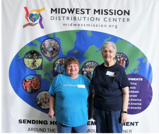
Athens UMC Athens, IL