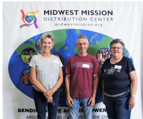
Simpson Group Springfield, IL