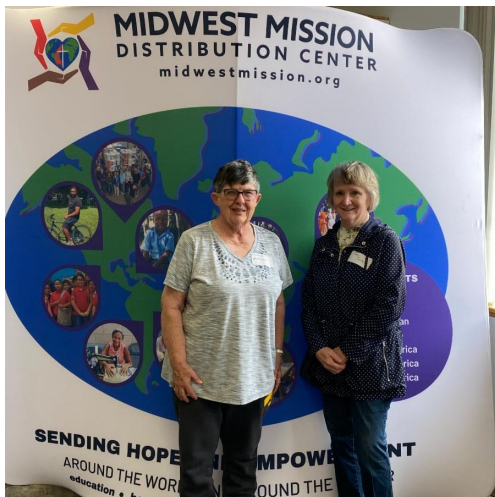
Hope UMC Blue Earth, MN