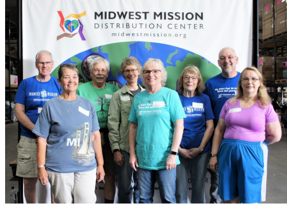
Riverside UMC Park Rapids, MN