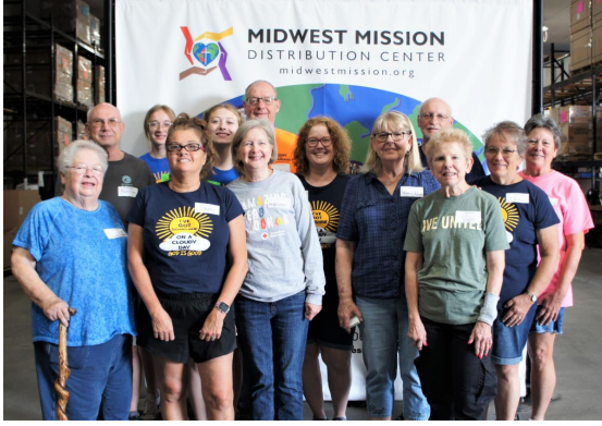
Salem UMC Evansville, IN