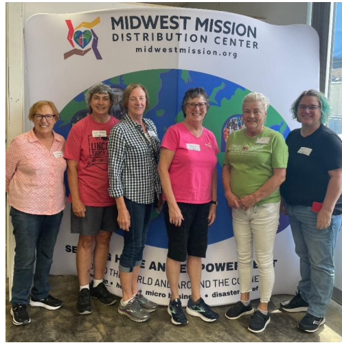
Great Plains Conference UWF Lincoln, NE

We are so grateful for all our regular volunteers, and the time they give towards volunteering at Midwest Mission. We appreciate their passion and dedication to the ministry!