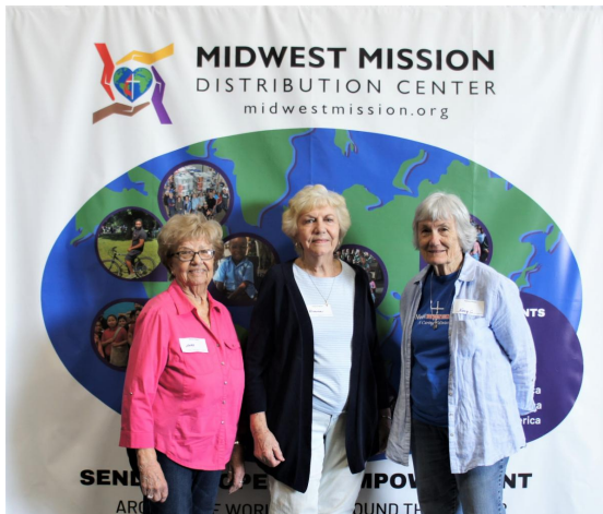
Wesley and Garver Brick UMC Decatur, IL