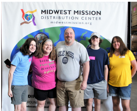
Church of the Good Shepherd Oswego, IL