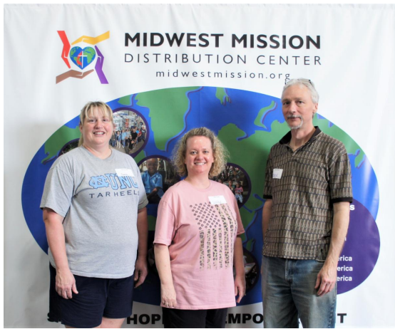
Wellspring UMC Oswego, IL