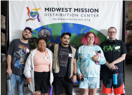
SPARC Summer Program Springfield, IL