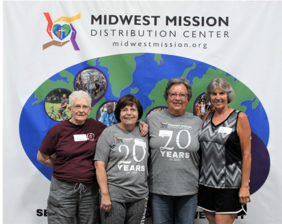
Richmond UMC Whitewater, WI