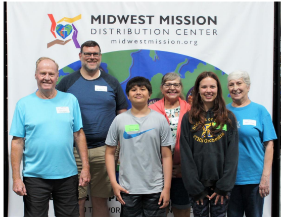
Coal City UMC Coal City, IL