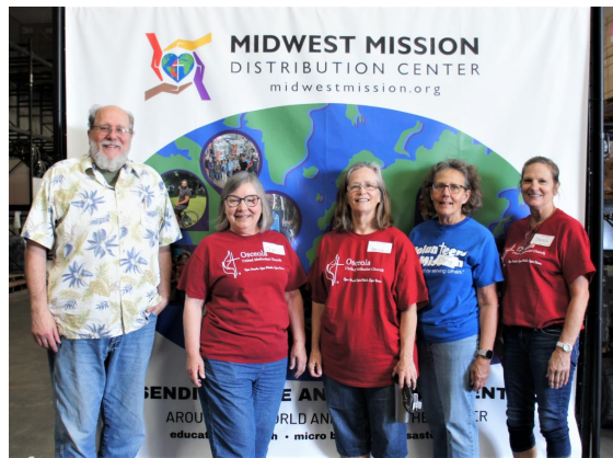
Osceola UMC Osceola, WI