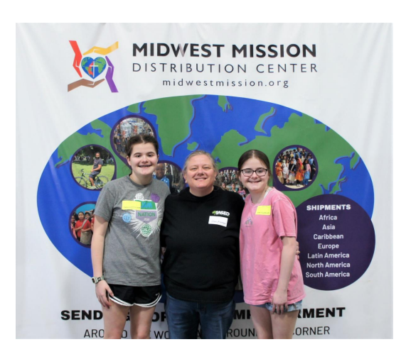
Athens UMC Afternoon Group Athens, IL