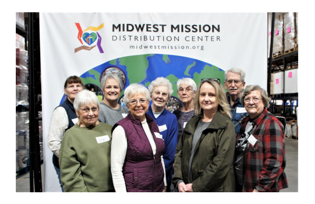
Taylorville UMC Taylorville, IL