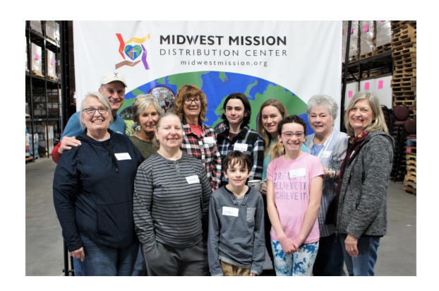
Hope Church - Local Serve Group Springfield, IL