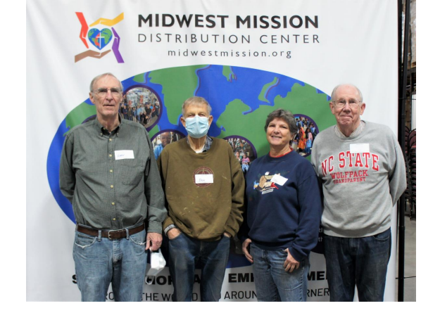
Douglas Avenue UMC Springfield, IL