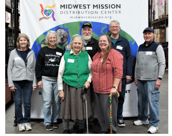
Monticello UMC Monticello, IL