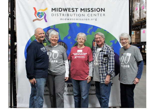
Union Reunion St. Louis, MO