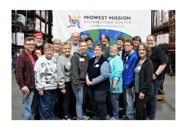
Great Lakes Team Michigan and Wisconsin