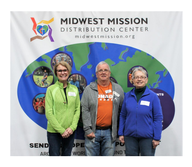
New Lenox UMC New Lenox, IL