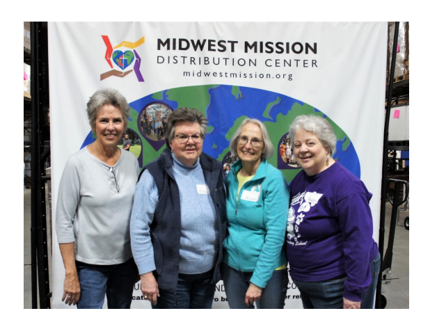
Hope Church - Simpson Group Springfield, IL