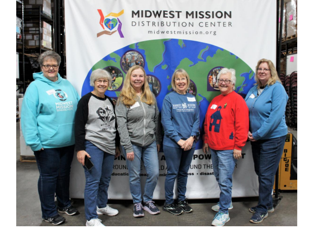
St Joseph UMC St. Joseph, IL