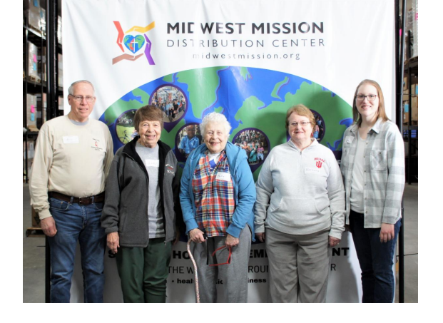
Chapel Hill UMC Indianapolis, IN