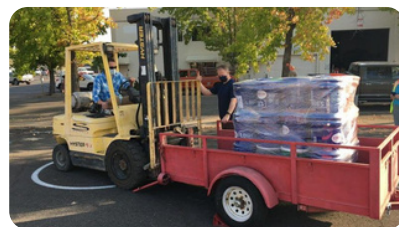
Unloading the much-needed UMCOR Cleaning Kits