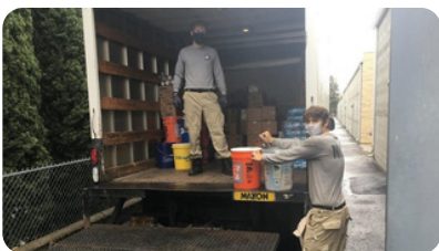
Americorps individuals unloading the UMCOR Cleaning Kits

"IN THE SAME WAY, LET YOUR LIGHT SHINE BEFORE OTHERS, THAT THEY MAY SEE YOUR GOOD DEEDS AND GLORIFY YOUR FATHER IN HEAVEN." MATTHEW 5:16