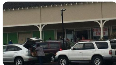
Families standing in line at the Fire Relief Center