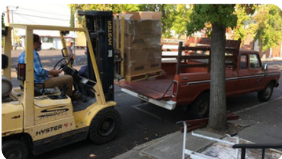
Unloading a pallet of the UMCOR Hygiene Kits