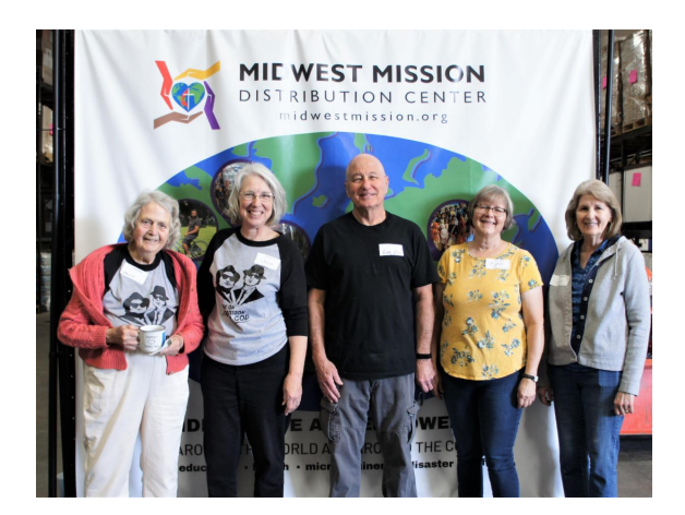
Monticello UMC Monticello, IL

We are so grateful for all our regular volunteers, and the time they give towards volunteering at Midwest Mission. We appreciate their passion and dedication to the ministry!