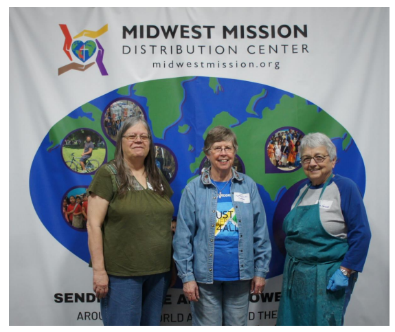
Centenary UMC Jacksonville, IL