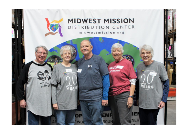
Union Reunion St. Louis, MO