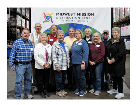
Knoxville UMC Knoxville, IL