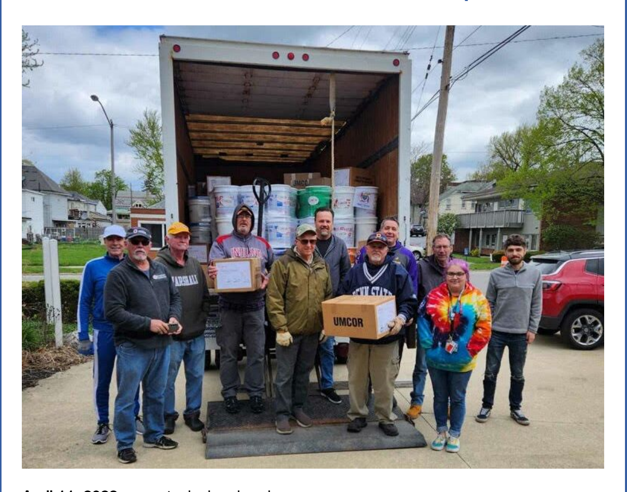
April 11, 2023 was a typical spring day in Richmond, Indiana. The sun was out, birds were chirping, and everything seemed normal. That was until local residents began to smell a foul odor that seemed to seep into their homes. Upon looking outside, residents could see thick, black smoke billowing amongst tall flames in the distance.