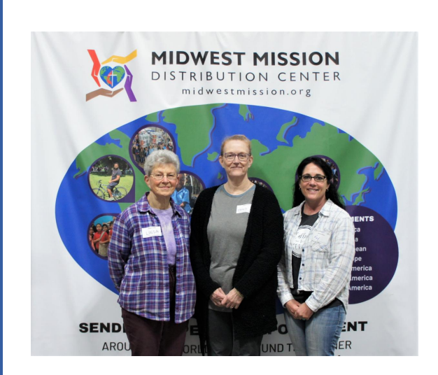
First UMC Rushville, IL