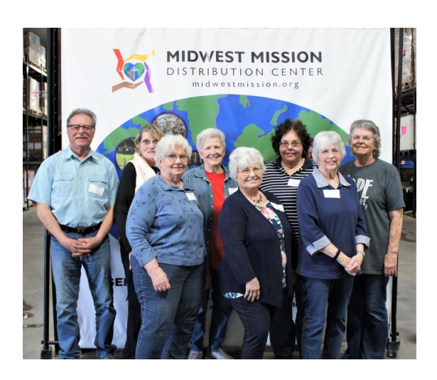
First UMC Lincoln, IL