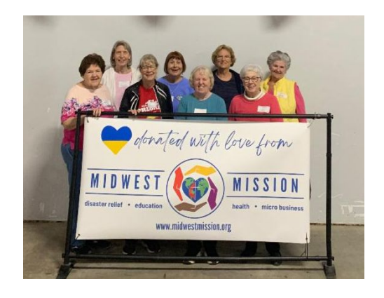
Green Trails UWF Chesterfield, MO

We are so grateful for all our regular volunteers, and the time they give towards volunteering at Midwest Mission. We appreciate their passion and dedication to the ministry!