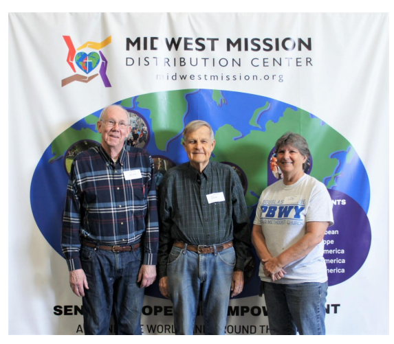
Douglas Avenue UMC Springfield, IL