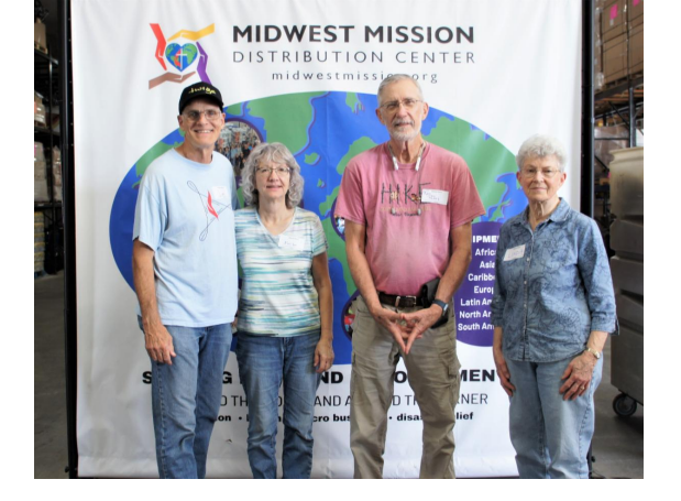
Wesley UMC Macomb, IL