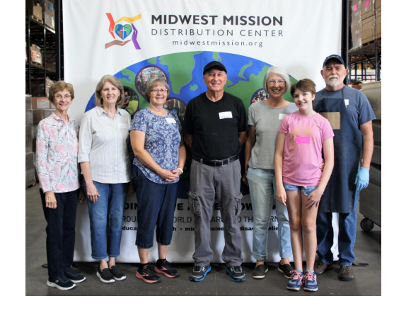
Monticello UMC Monticello, IL