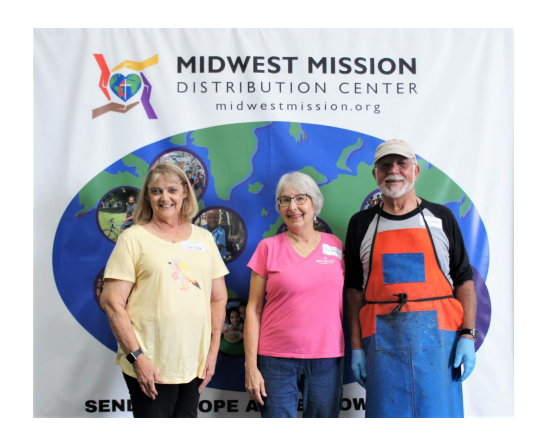
Grace UMC Jacksonville, IL