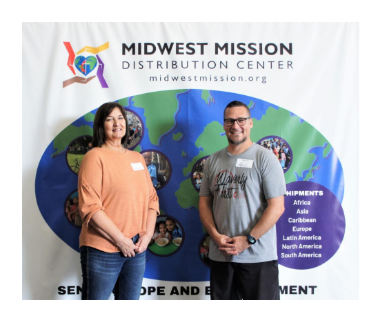
Waverly First UMC Waverly, IL