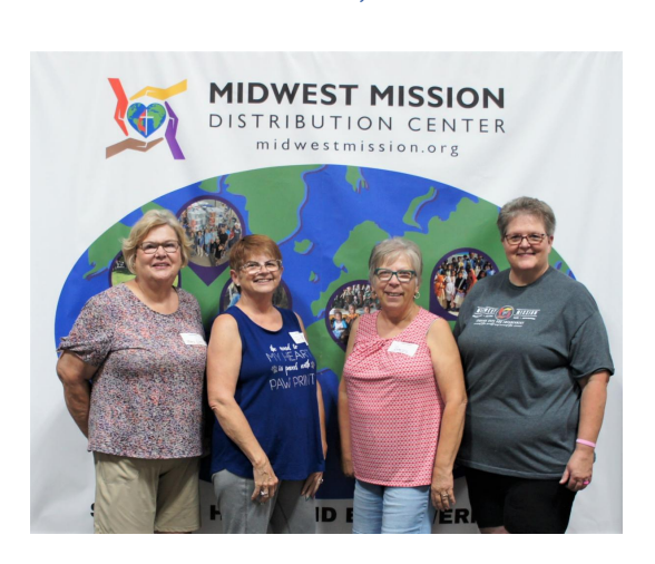
St. Joseph UMC St. Joseph, IL