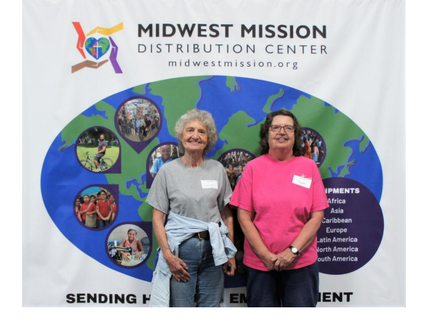
Community Fellowship Jamestown, IN