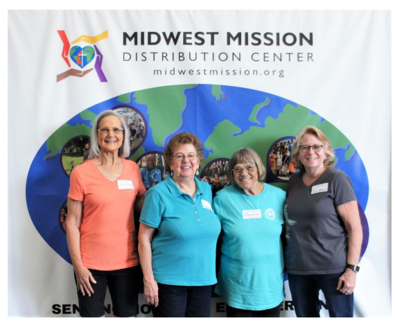
Quilting Friends Jacksonville, IL