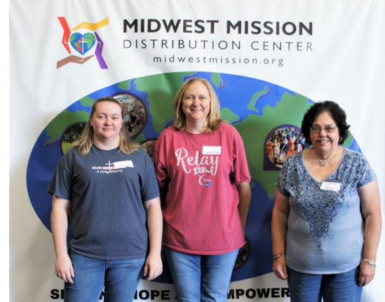
Lincoln First UMC Lincoln, IL