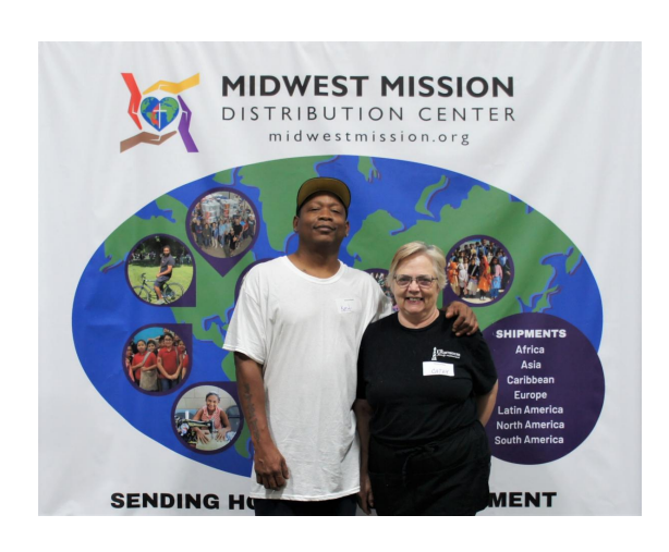
Lighthouse Rochester, IL