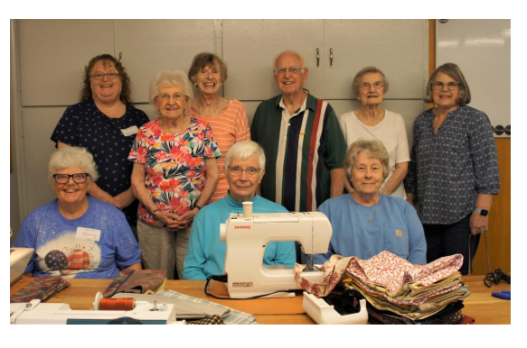
Springfield First UMC Sewing Group Springfield, IL