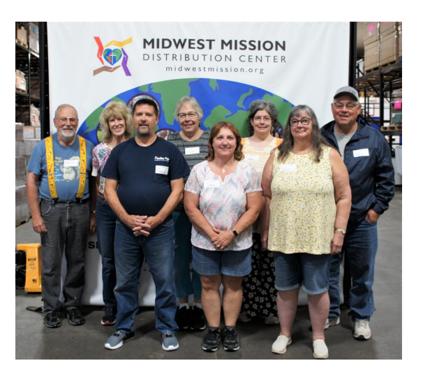
Willmar UMC Willmar, MN