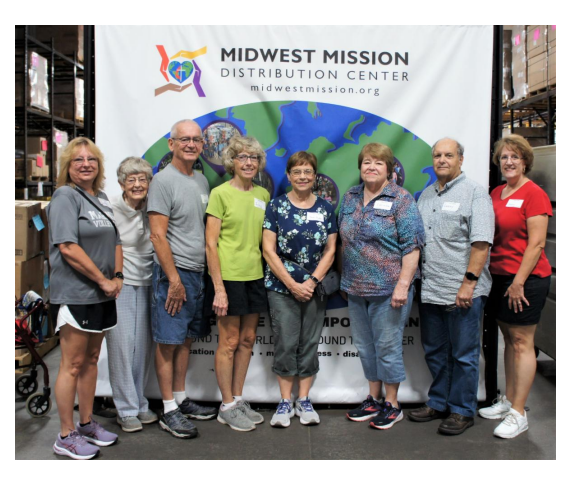
Calvary UMC Normal, IL