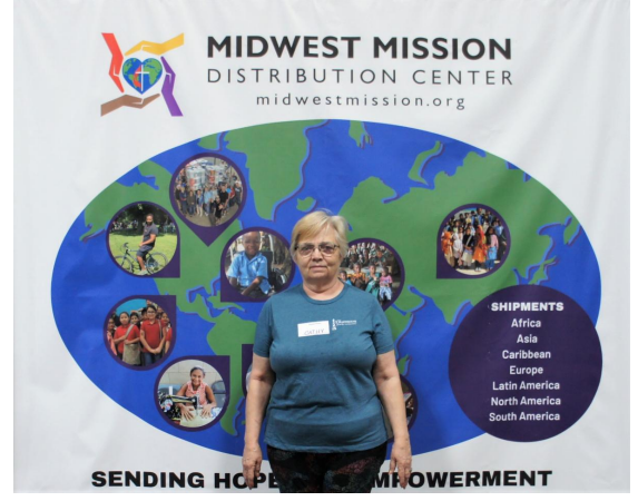
Lighthouse Rochester, IL