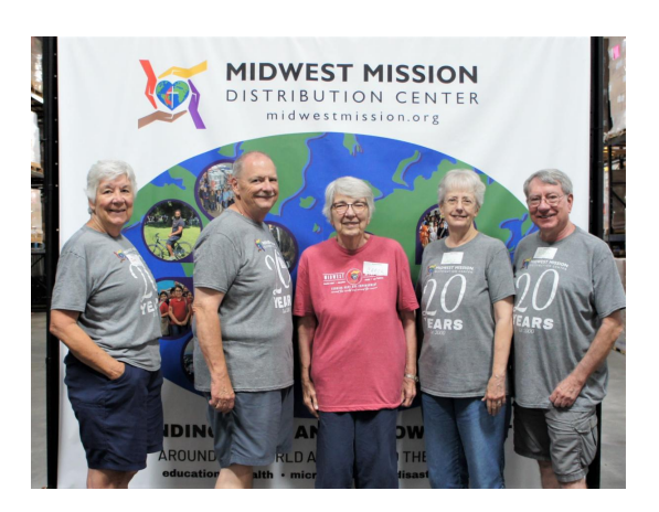
Union Reunion St. Louis, MO