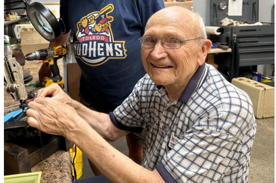
First UMC West Allis, WI