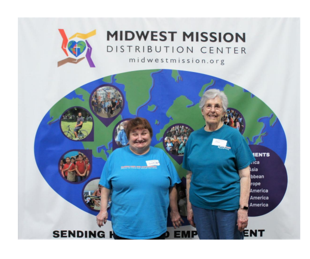
Athens UMC Athens, IL