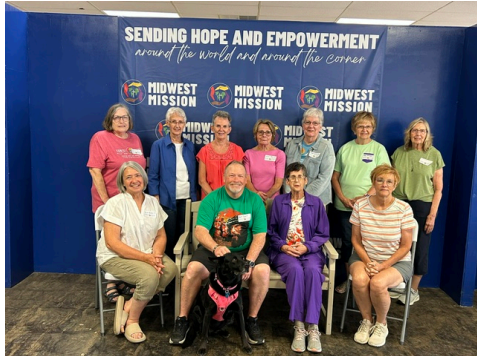
Lakes United Women in Faith and Fort Dodge UMC