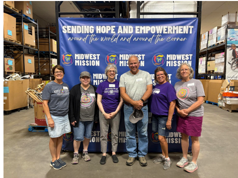
First UMC Dixon, IL