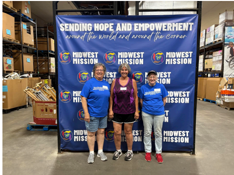
Richmond UMC Whitewater, WI