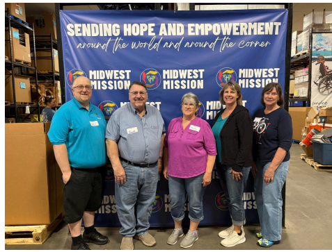
Warren UMC Warren, IL