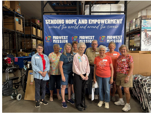
Taylorville UMC Taylorville, IL