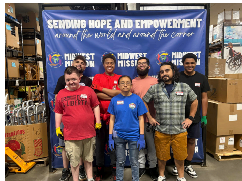
SPARC Summer Program