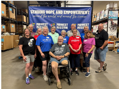
Pathway Global Methodist Church St. Joseph, MI