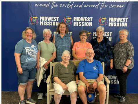
Bethel Warriors Boone, IA