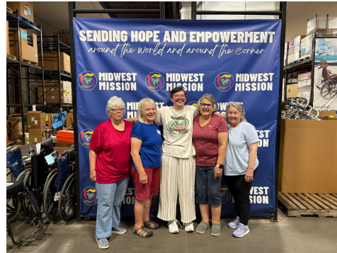
Sewing Group First UMC Springfield, IL