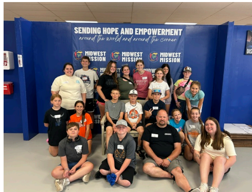
Carroll First UMC Carroll, IA