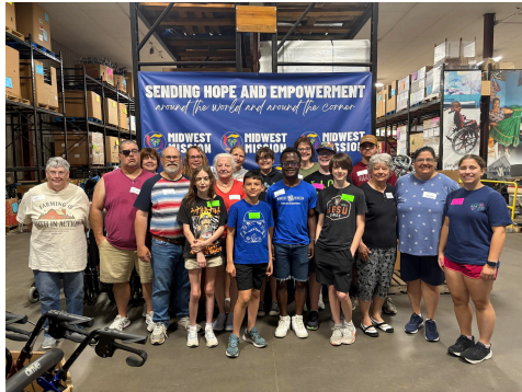
The Wesley UMC Bryan, OH