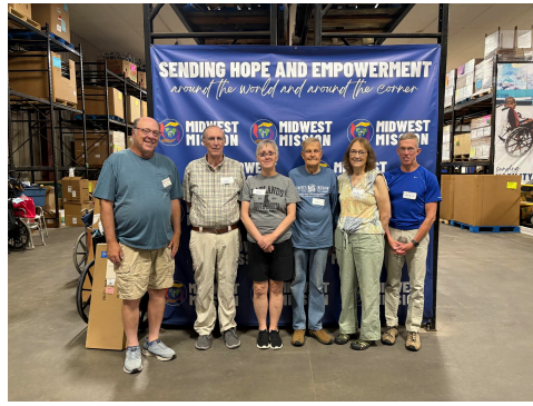
Douglas Avenue Springfield, IL