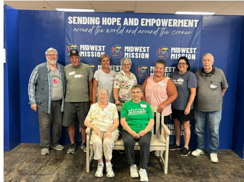
Lanesboro UMC Lanesboro, IA