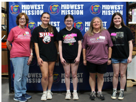
Athens UMC Athens, IL