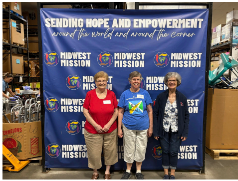
Centenary UMC Jacksonville, IL