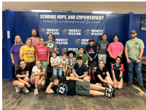
Elkhorn Hills Elkhorn, NE