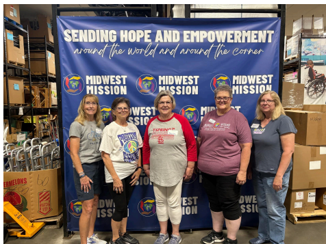
St. Joseph UMC