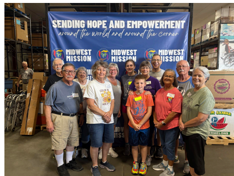
Plainfield UMC Plainfield, IL