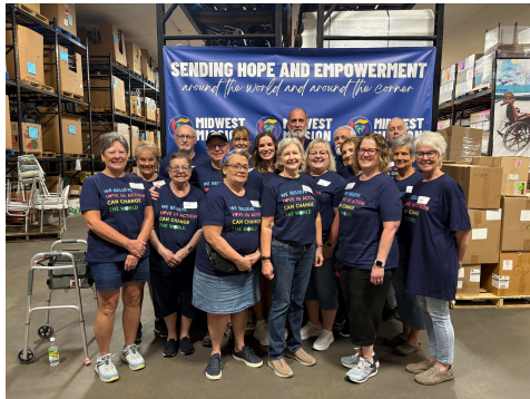
Salem UMC Evansville, IN