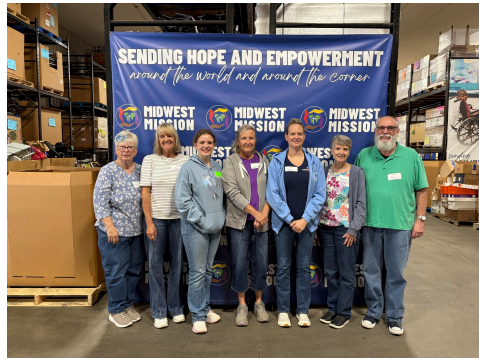
Bellflower IL UWF Bellflower, IL