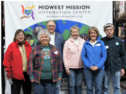
First UMC Baraboo, WI