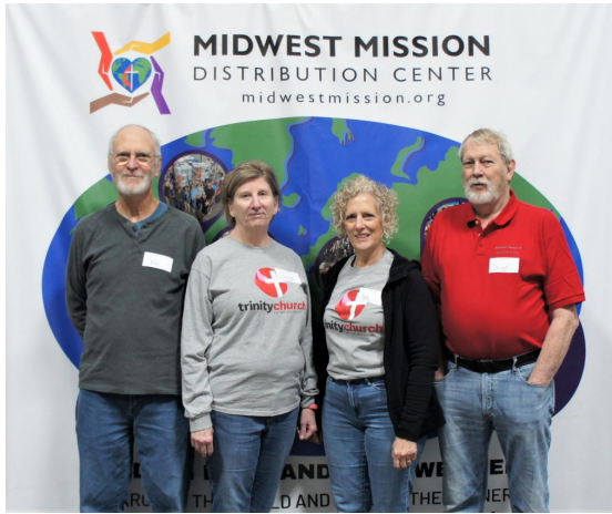
Trinity New Albany, IN