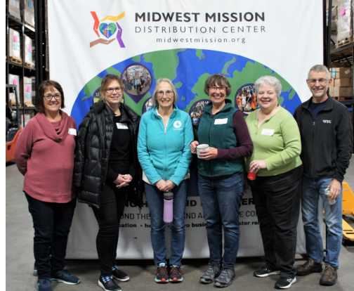
Simpson Group Springfield, IL

We are so grateful for all our regular volunteers, and the time they give towards volunteering at Midwest Mission. We appreciate their passion and dedication to the ministry!