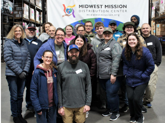
South Side Christian Church Springfield, IL