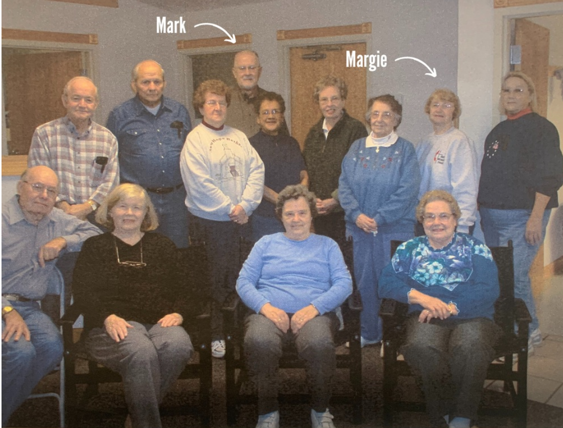
A FRIENDLY, HARD WORKING GROUP FROM OHIO VOLUNTEERING NOVEMBER 18-19, 2004