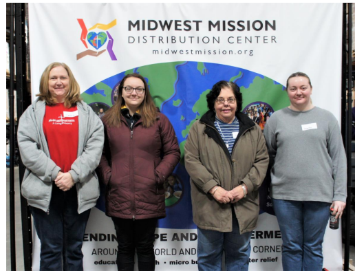
Lincoln First UMC Lincoln, IL

We are so grateful for all our regular volunteers, and the time they give towards volunteering at Midwest Mission. We appreciate their passion and dedication to the ministry!