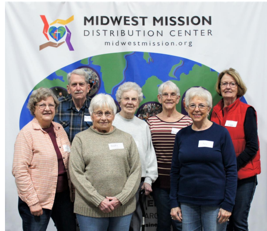
Taylorville UMC Taylorville, IL