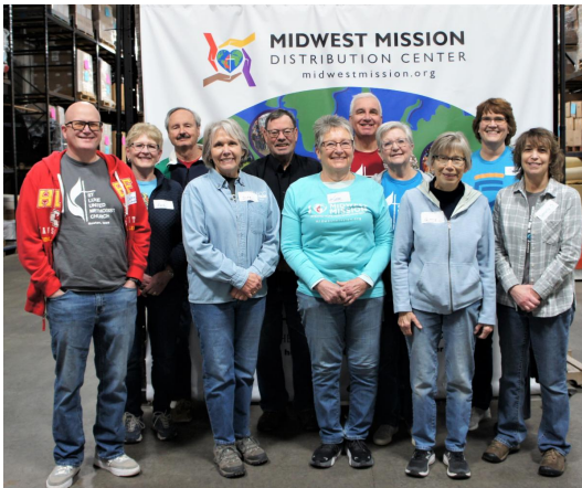
St. Luke Newton, IA