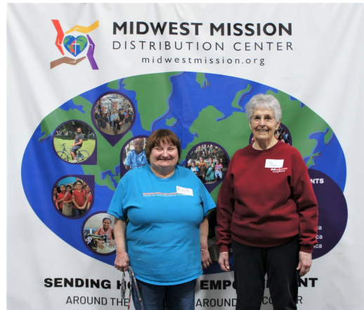
Athens UMC Athens, IL