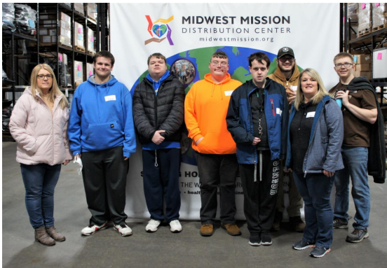
SASED Morning Shift Springfield, IL