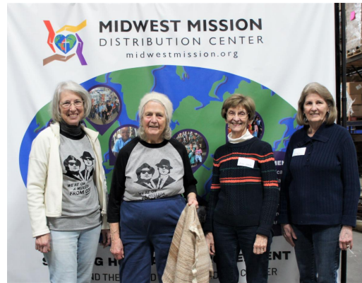
Monticello UMC Monticello, IL