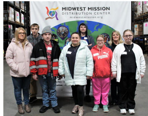
SASED Afternoon Shift Springfield, IL

We are so grateful for all our regular volunteers, and the time they give towards volunteering at Midwest Mission. We appreciate their passion and dedication to the ministry!