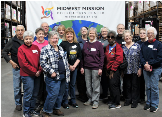
First UMC Valparaiso, IN