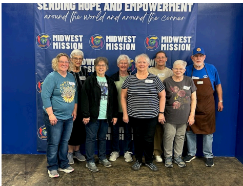
Bethel Warriors Boone, IA