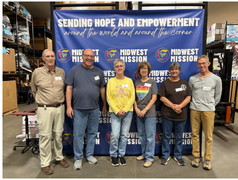
Douglas Avenue UMC Springfield, IL