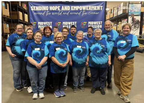
Great Lakes Team Michigan & Wisconsin