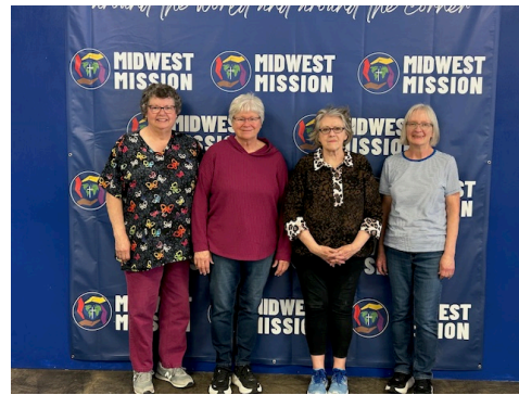
Grace UMC Tiffin, IA