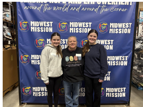
Athens UMC Athens, IL