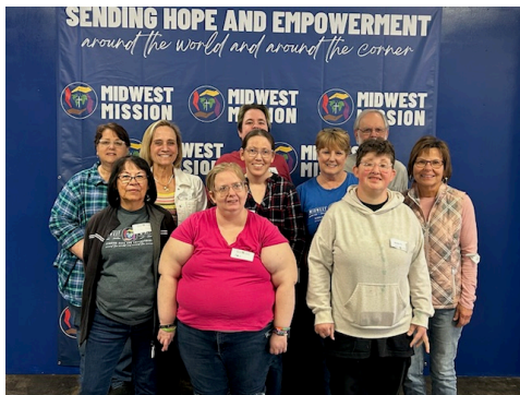
Special Women on a Mission