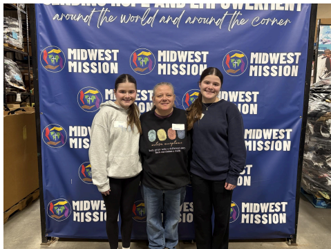
Athens UMC Athens, IL