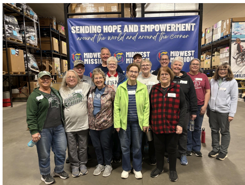
Grace UMC Lansing, MI