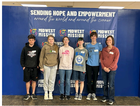
Paton-Churdan NHS Churdan, IA