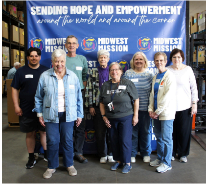
First UMC Sewing Group Springfield, IL