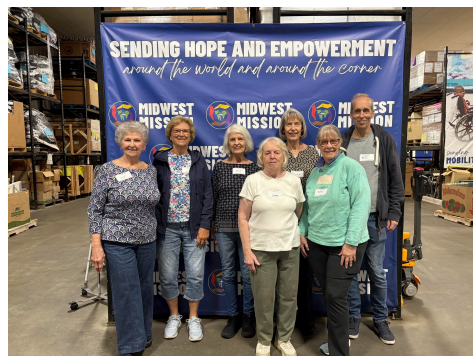
Union Reunion St. Louis, MO