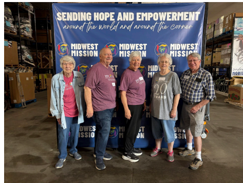
Simpson Group Springfield, IL