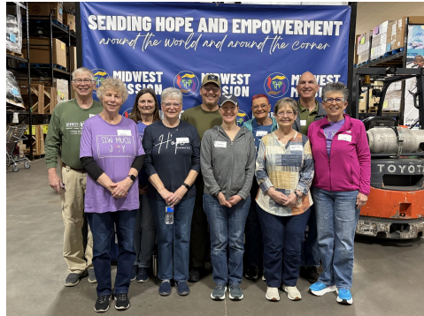
Sew Much Joy Glen Carbon, IL