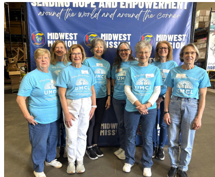
Libertyville UMC Libertyville, IL