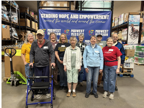
First UMC Glen Ellyn, IL