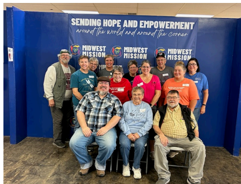
Lanesboro UMC Lanesboro, IA