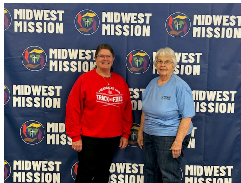
Hope Church Pocahontas, IA