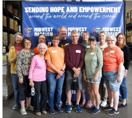
Taylorville UMC Taylorville, IL