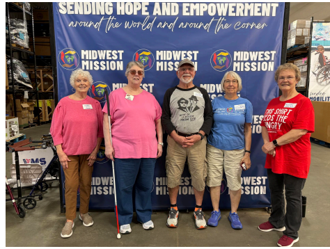
Grace UMC Jacksonville, IL