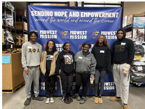
UIS Students Springfield, IL