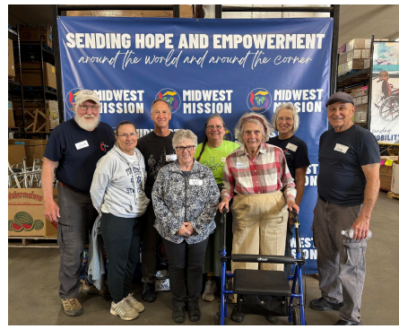
Monticello UMC Monticello, IL