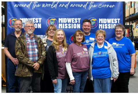
Batestown & Union Corner UMC's Danville, IL