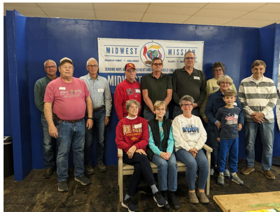
Panora UMC Panora, IA