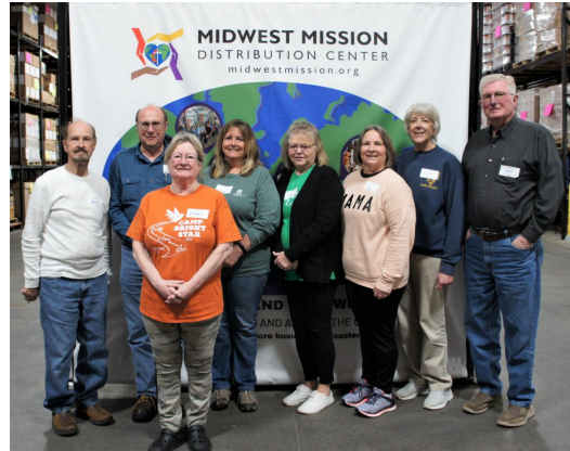
Bright Star Parish UMC Bluffs, IL