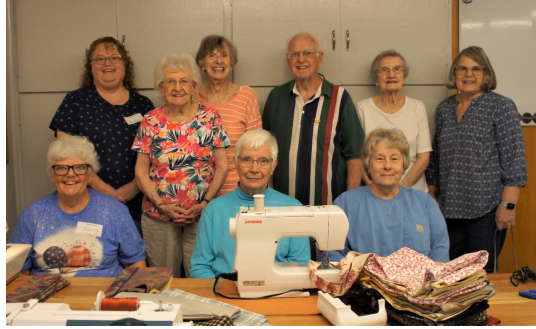
Sewing Group First UMC Springfield, IL