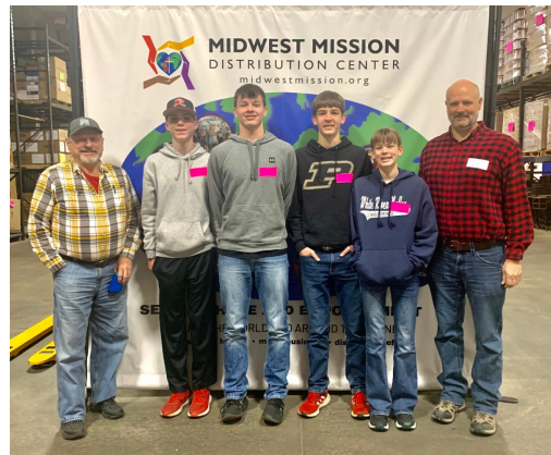
412 Youth Group Worthington, IN