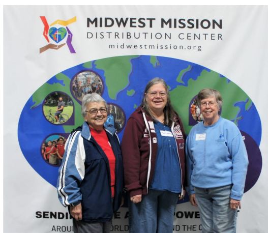
Centenary UMC Jacksonville, IL