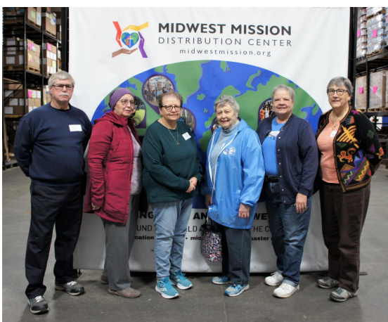
Meridian Street UMC Indianapolis, IN