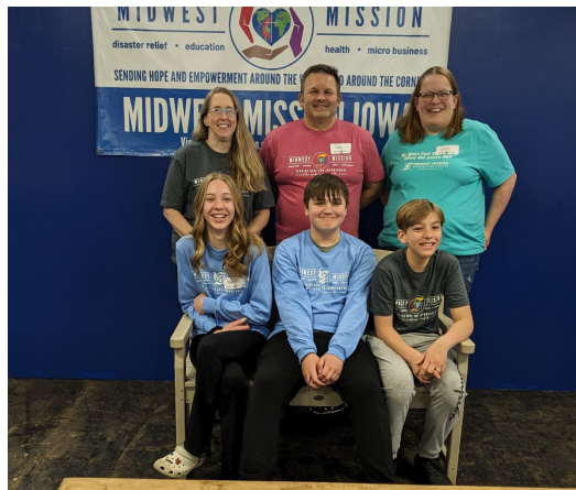
First UMC Youth Baraboo, WI