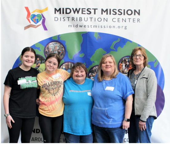
Athens UMC Athens, IL