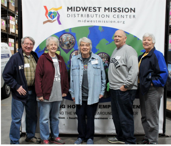
Union Reunion St. Louis, MO