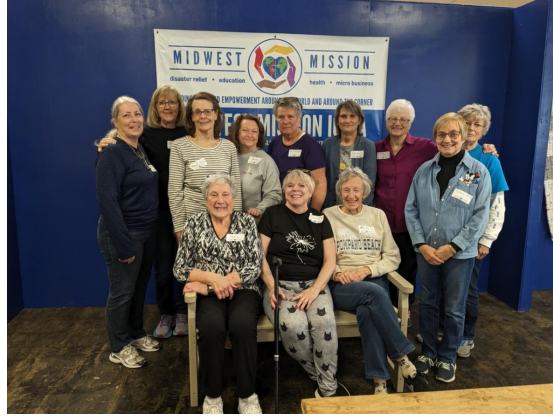
Windsor, Maple Grove, and Walnut Hills Churches Des Moines, IA