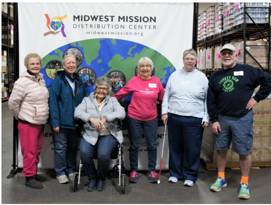
Grace UMC Jacksonville, IL