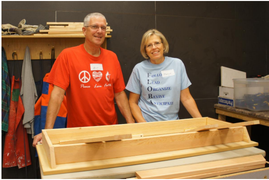
First MC Flora, IL