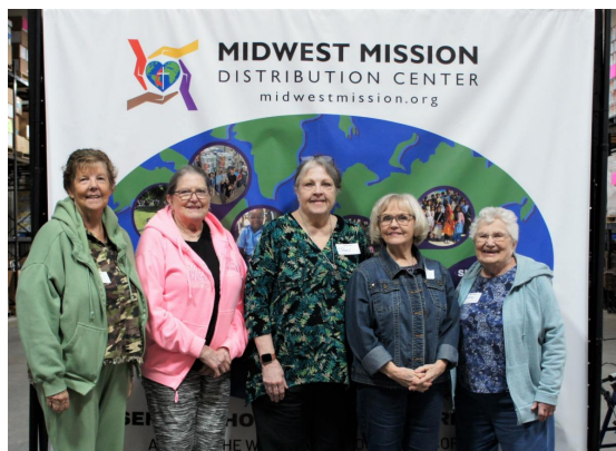
Savoy UMC Savoy, IL