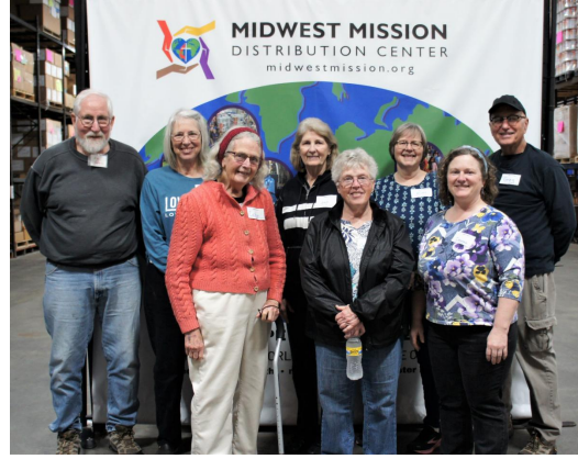
Monticello UMC Monticello, IL