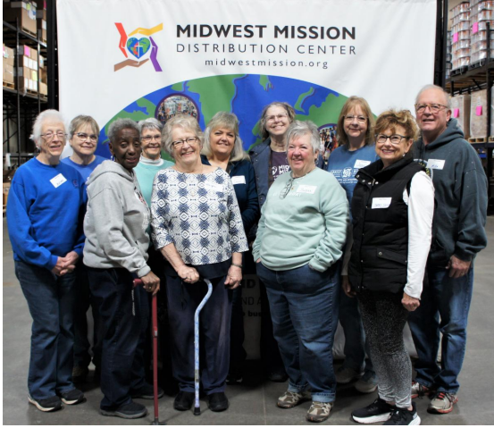
First UMC Valparaiso, IN