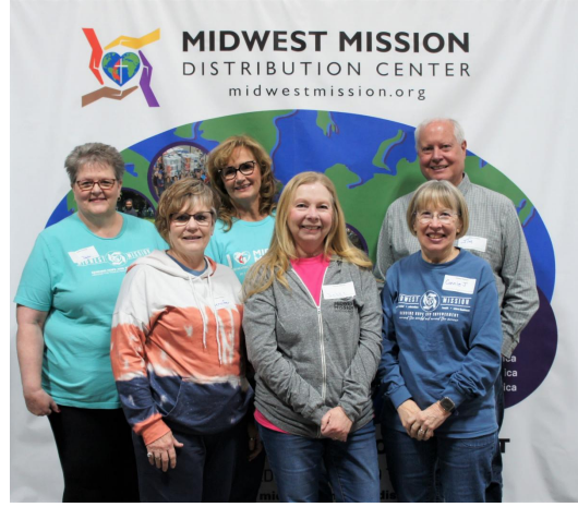
St. Joseph UMC St. Joseph, IL