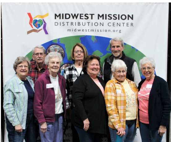
Taylorville UMC Taylorville, IL