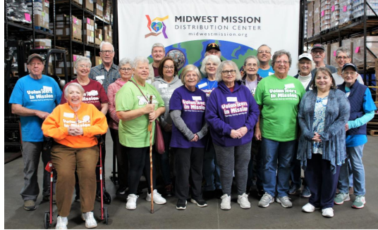
Wisconsin Volunteers in Mission