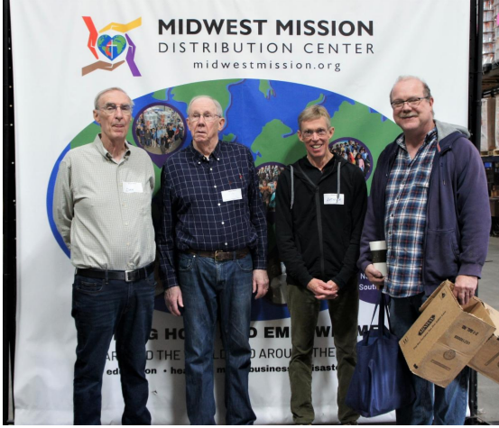
Douglas Avenue UMC Springfield, IL