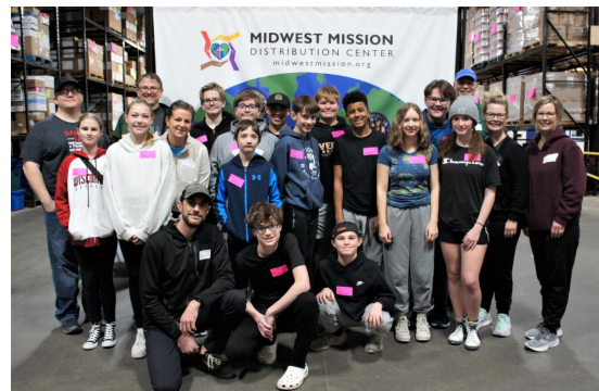
Sugar River UMC Verona, WI