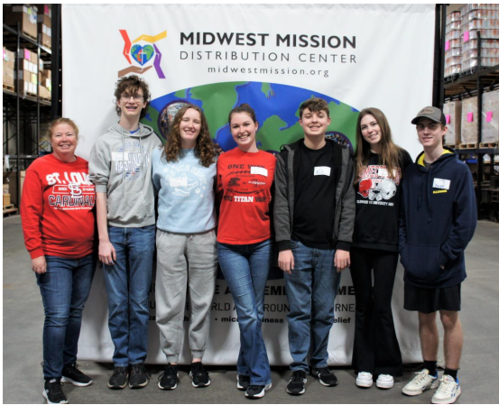
Fraze and Friends Chatham, IL