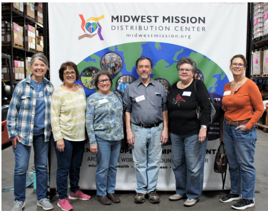
Simpson Group Springfield, IL