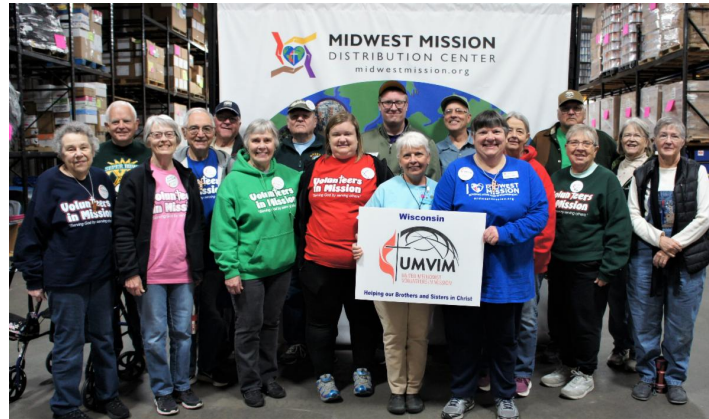
Wisconsin Volunteers in Mission Wisconsin