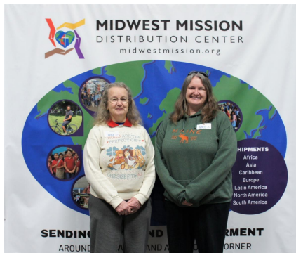
First UMC Batesville, IN