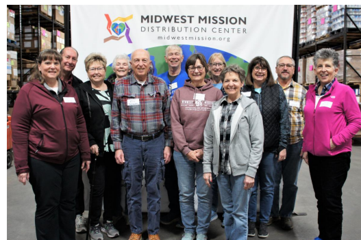
Sew Much Joy Glen Carbon, IL