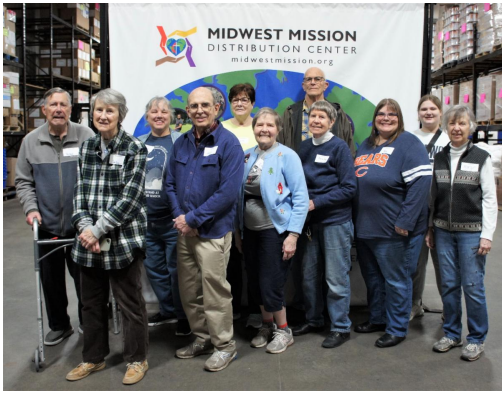
First UMC Glen Ellyn, IL