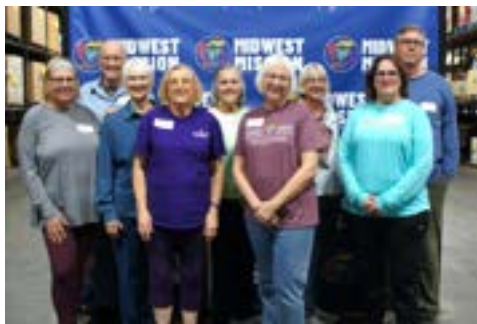
Concord Trinity UMC St. Louis, MO