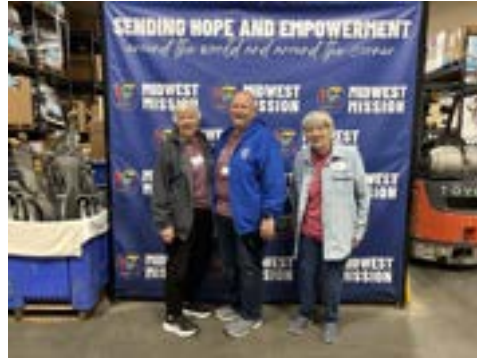
Union Reunion St. Louis, MO