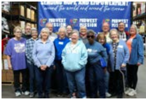
First UMC Valparaiso, IN