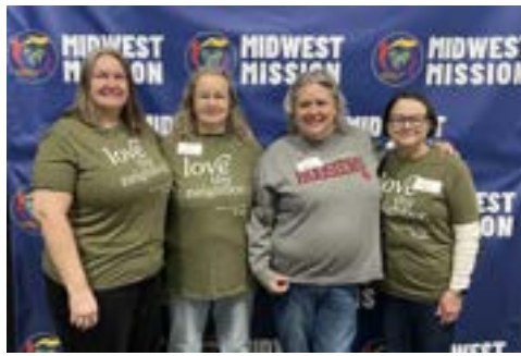
Carmel UMC Carmel, IN