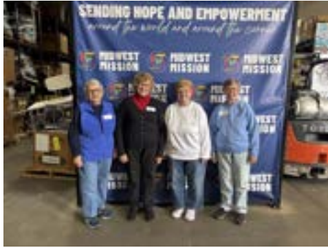
Centenary UMC Jacksonville, IL