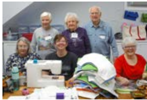
First UMC Sewing Group Springfield, IL