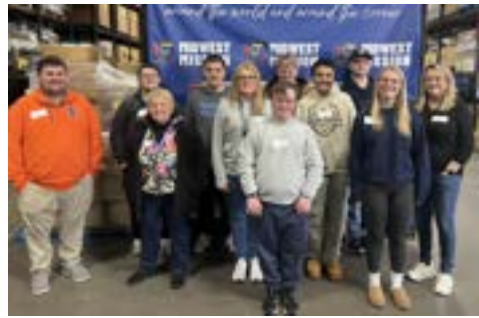
SASED PM Springfield, IL