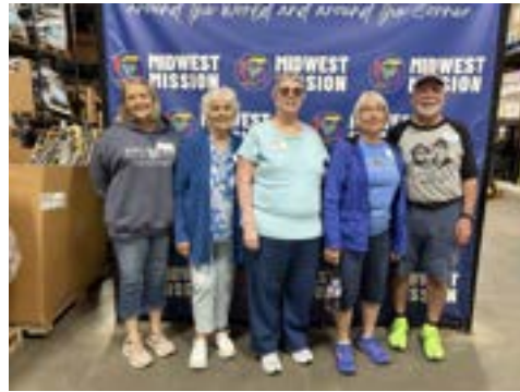
Grace UMC Jacksonville, IL