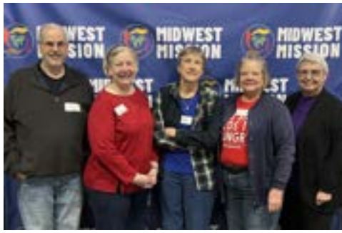
Meridian Street UMC Indianapolis, IN