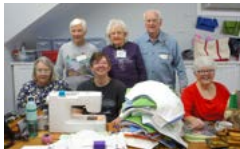
Sewing Group First UMC Springfield, IL