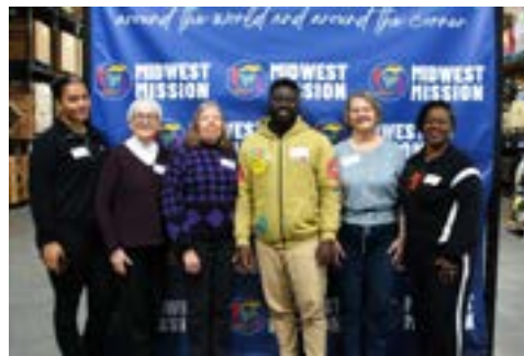
First UMC Lebanon, IL