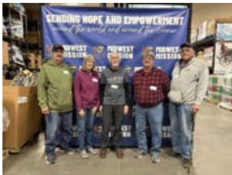
Gibson City UMC Gibson City, IL