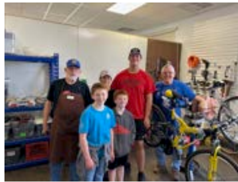
Central Christian Church