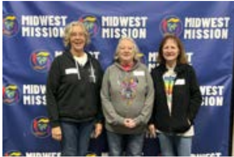
United Protestant Church Grayslake, IL