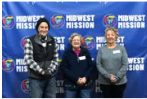
Taylorville UMC Taylorville, IL