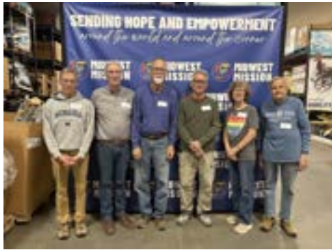
Douglas Avenue UMC Springfield, IL