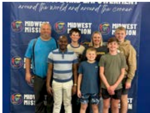
Hope UMC Blue Earth, MN