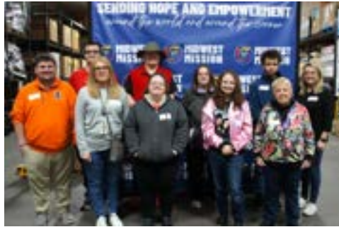
SASED AM Springfield, IL