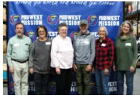
Simpson Group Springfield, IL