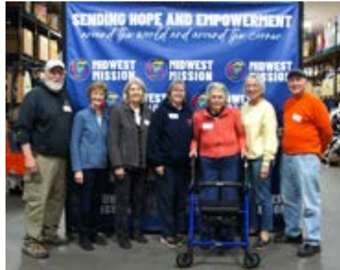
Monticello UMC Monticello, IL