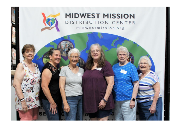
Savoy UMC Savoy, IL