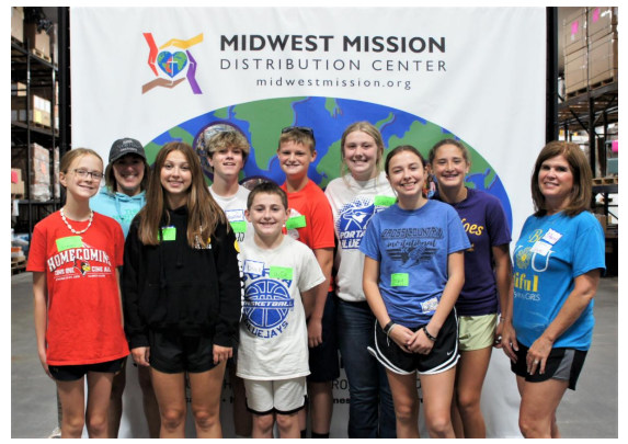
Petersburg UMC Youth Mission Camp Group 2 Petersburg, IL