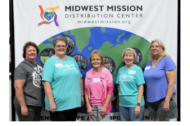
St. Joseph UMC St. Joseph, IL