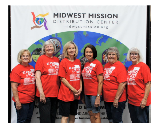
Baker Memorial UMC St. Charles, IL