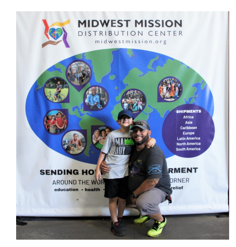
Ortiz Crew Springfield, IL