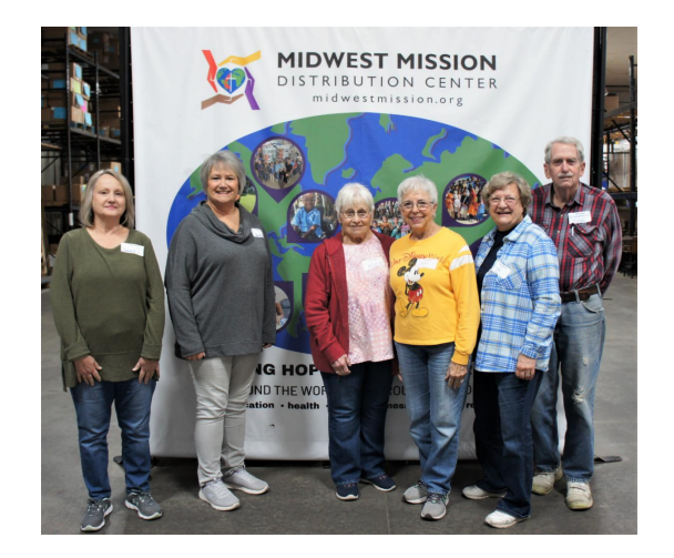
Taylorville UMC Taylorville, IL