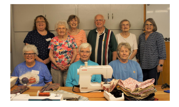
Springfield First UMC Sewing Group Springfield, IL