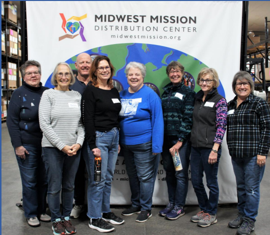
Simpson Group Springfield, IL