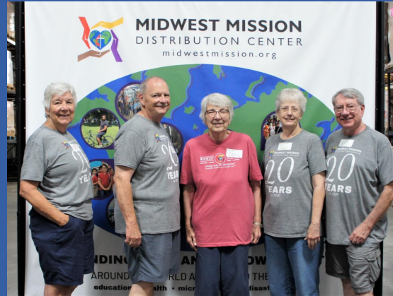
Union Reunion St. Louis, MO