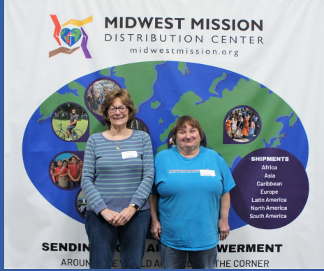
Athens UMC Athens, IL