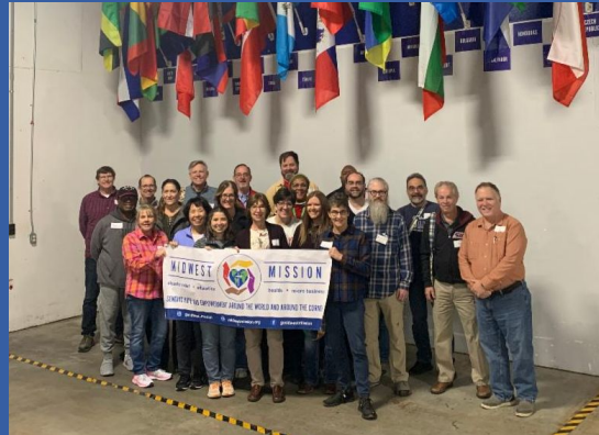
IGRC Staff Springfield, IL