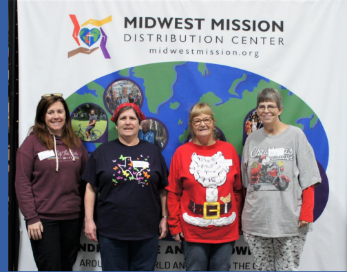
Channahon UMC Channahon, IL