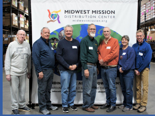
Douglas Avenue Springfield, IL