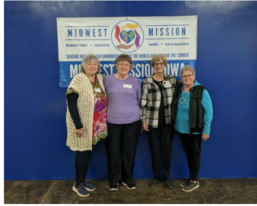
Grace UMC Story City, IA

Thank you again to our great inventory team for all of your hard work this week!