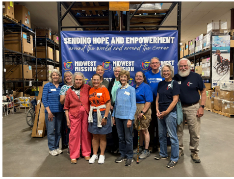
Monticello UMC Monticello, IL