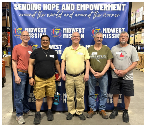
Manawa Manawa, WI