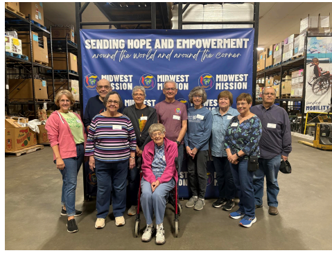
Calvary UMC Normal, IL