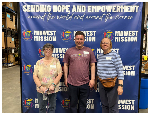
Oakwood/Catlin UMCs IL