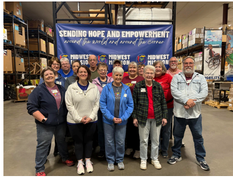
River of Life UMC Beloit, WI