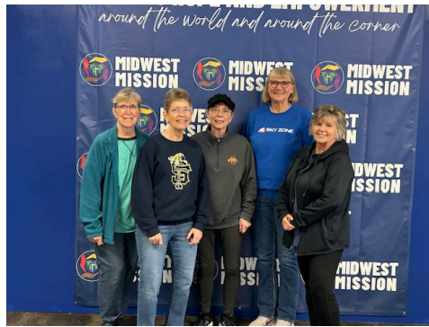
Central Christian Church Jefferson, IA