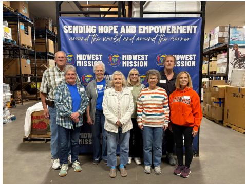
Knoxville UMC Knoxville, IL