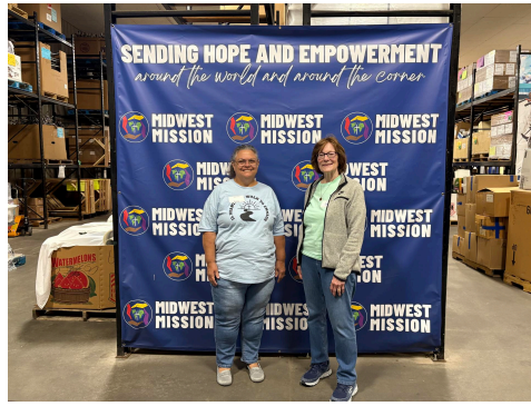
Athens UMC Athens, IL