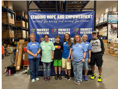
Grace UMC Jacksonville, IL