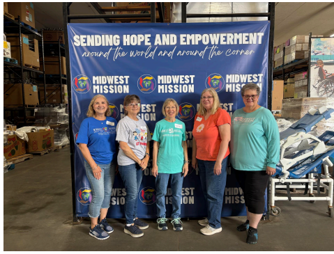
St. Joseph UMC St. Joseph, IL