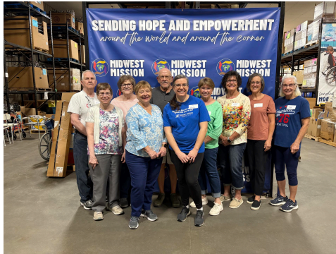
Wesley Chapel UMC Jacksonville, IL