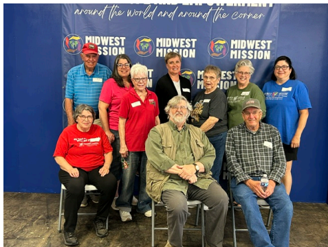
Lanesboro UMC Lanesboro, IA