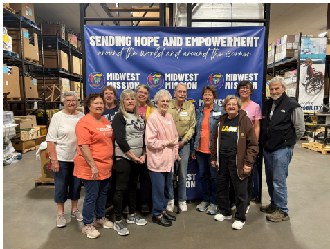
Taylorville UMC Taylorville, IL