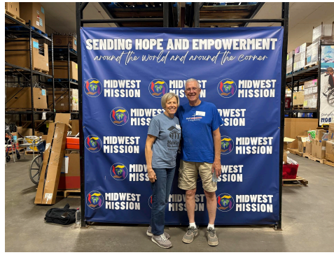
First MC Flora, IL