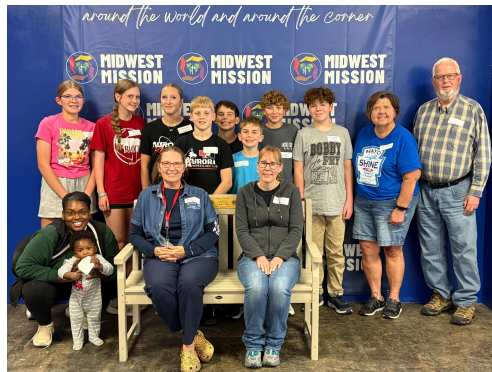
Aurora UMC Aurora, NE