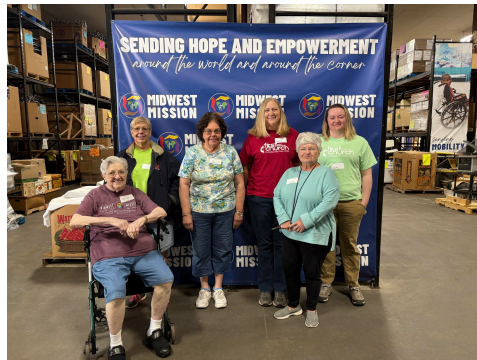
Lincoln First UMC Lincoln, IL