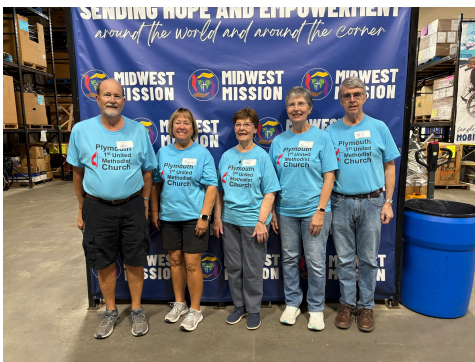
First UMC Plymouth, IN