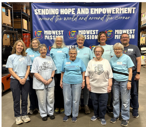
Webster UMC Webster Groves, MO