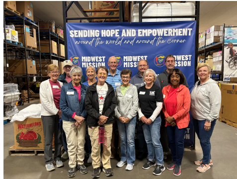
First UMC O'Fallon, IL