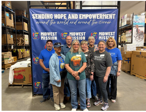
Bright Star Parish UMC Bluffs, IL