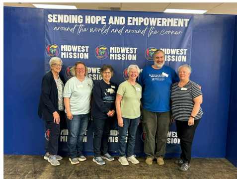
Bethel Warriors Boone, IA