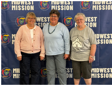
Foundry Circuit Maquoketa, IA