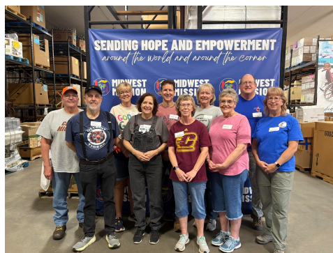
Midland First UMC Midland, MI