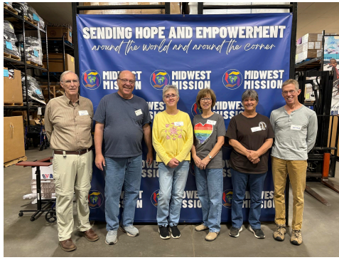
Douglas Avenue UMC Springfield, IL