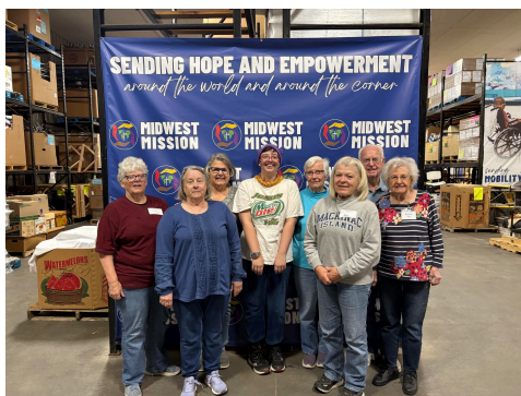
Sewing Group First UMC Springfield, IL